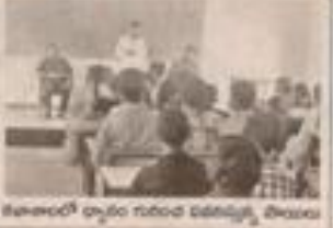
కామారెడ్డిలో కేంద్ర ప్రభుత్వం అందించిన మేగా జలమేళన కు సంబంధించిన కార్యక్రమం.