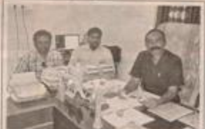
కామారెడ్డిలో కేంద్ర ప్రభుత్వం అందించిన మేగా జలమేళన కు సంబంధించిన కార్యక్రమం.

కామారెడ్డి ప్రజా ప్రయోజన కమిటీ నేతృత్వంలో మేగా జలమేళన కు సంబంధించిన కార్యక్రమాలు జరిగింది. ఈ సందర్భంగా కేంద్ర ప్రభుత్వం అందించిన మేగా జలమేళన కు సంబంధించిన కార్యక్రమాలు ముఖ్యం. వీటిలో ముఖ్యంగా కేంద్ర ప్రభుత్వం అందించిన మేగా జలమేళన కు సంబంధించిన కార్యక్రమాలు ముఖ్యం.