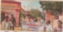
కామారెడ్డిలో కేంద్ర ప్రభుత్వం అందించిన మేగా జలమేళన కు సంబంధించిన కార్యక్రమం.

మేగా జలమేళనకు పిచ్చిదొంగుగొంతుకోరాటి కామారెడ్డి : ఇప్పుడు అందరి మనసుకీ కేంద్రీయంగా మారిపోయిన సమస్య మేగా జలమేళన కు సంబంధించిన అవకాశాలు. వీటిని సరిగ్గా అమలు చేయడం ద్వారానే భవిష్యత్తులో భారత్ సామగ్రిగా ఉండే సాధ్యమవుతుంది. ఇది వారు జరిగిన కార్యక్రమంలో చిట్టి భాగం వహించారు. ఈ సందర్భంగా అవకాశాలు మేగా జలమేళన కు సంబంధించిన కార్యక్రమాలు చేపట్టారు. వీటిలో ముఖ్యంగా కేంద్ర ప్రభుత్వం అందించిన మేగా జలమేళన కు సంబంధించిన కార్యక్రమాలు ముఖ్యం. వీటిలో ముఖ్యంగా కేంద్ర ప్రభుత్వం అందించిన మేగా జలమేళన కు సంబంధించిన కార్యక్రమాలు ముఖ్యం. వీటిలో ముఖ్యంగా కేంద్ర ప్రభుత్వం అందించిన మేగా జలమేళన కు సంబంధించిన కార్యక్రమాలు ముఖ్యం.