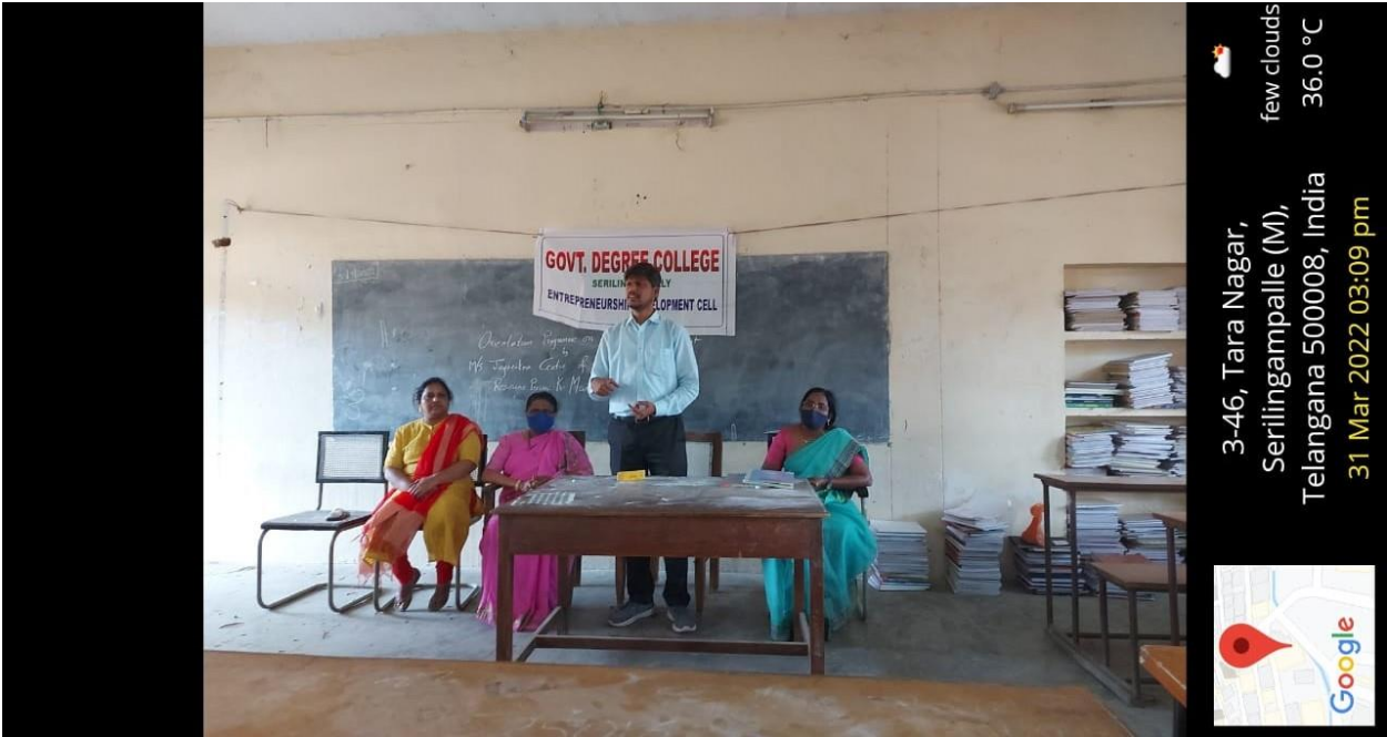
Students at Jayaratna centre for excellence