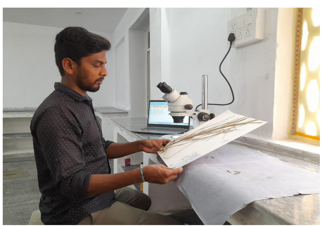
Research Scholar observing in computer attached microscope