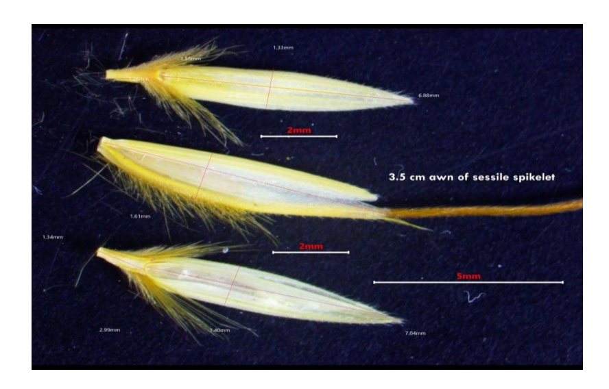
The Microscopic Photographs taken as a part of research work