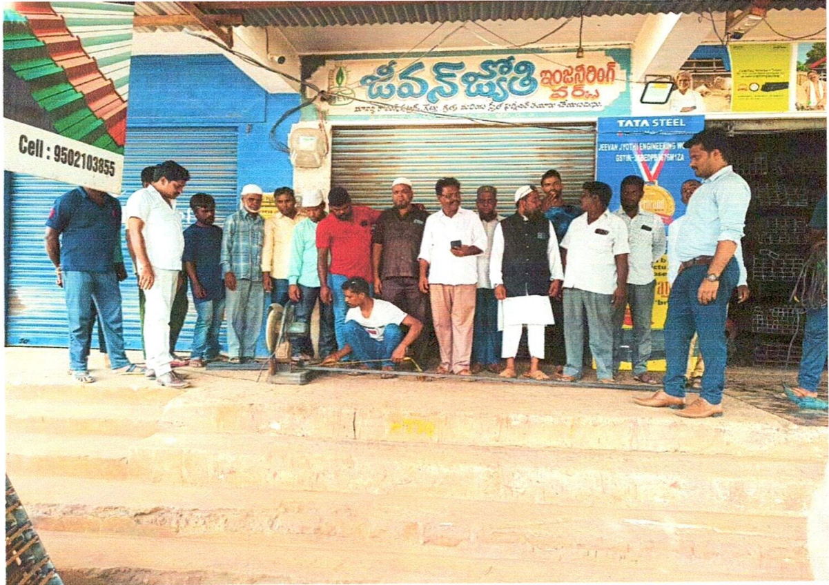
Live Classes to the participants