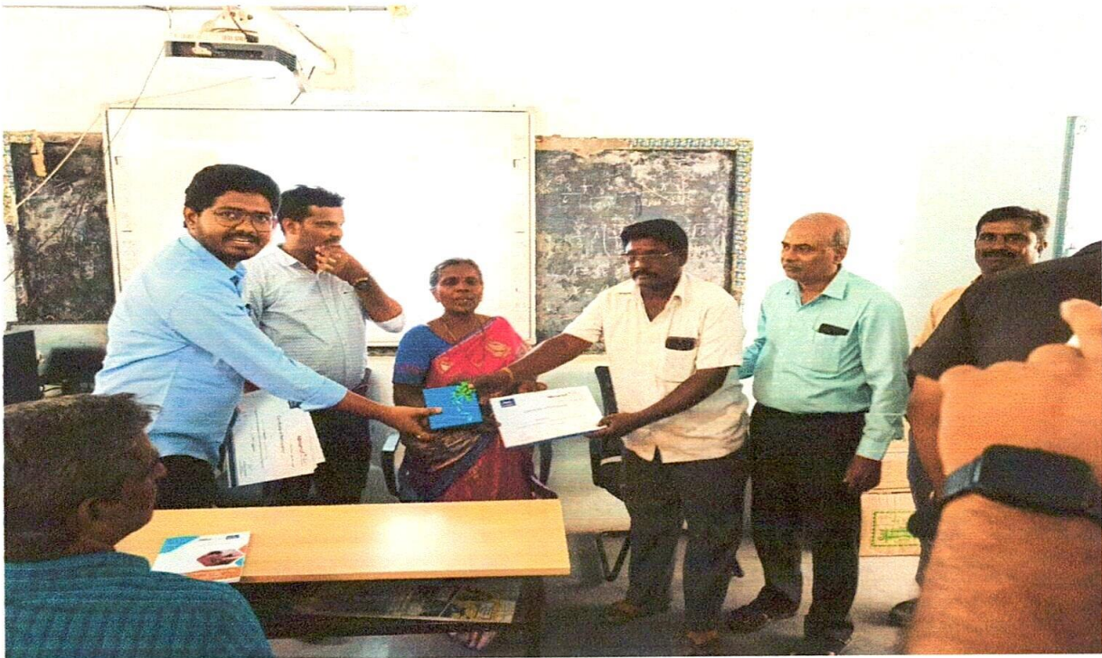
Issuing of Certificate to the participants