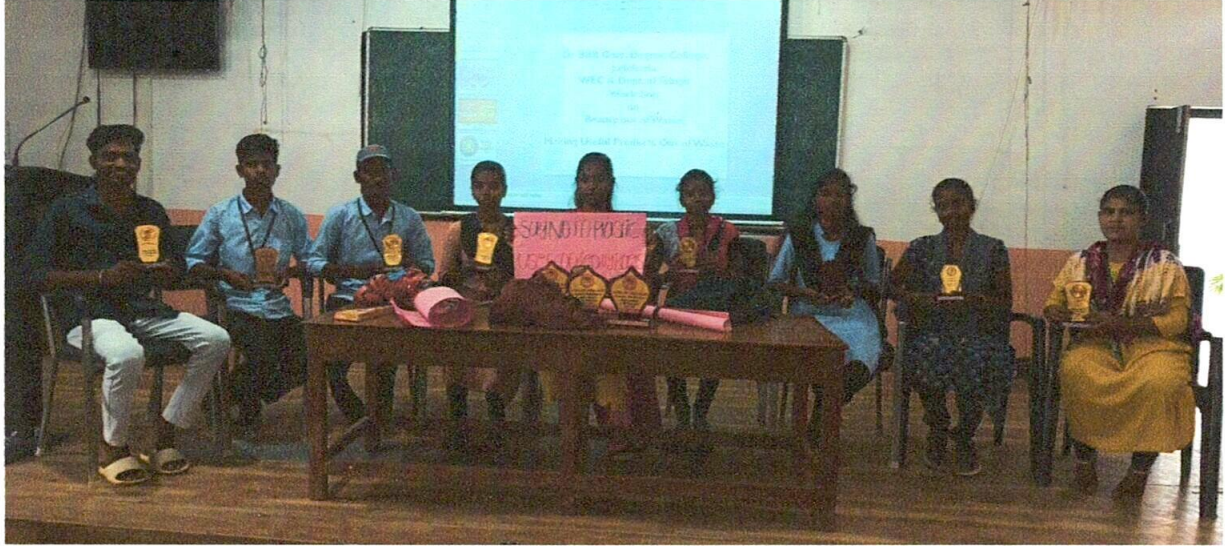
Volunteer of solid waste management