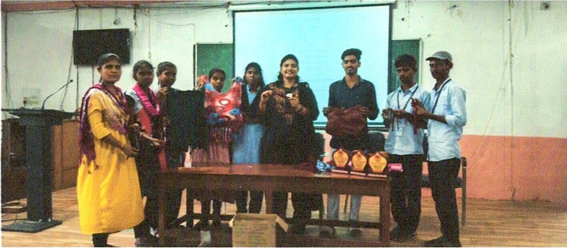
Showing bags prepared out of T shirts by not using thread and needle.(Instant cloth bags)