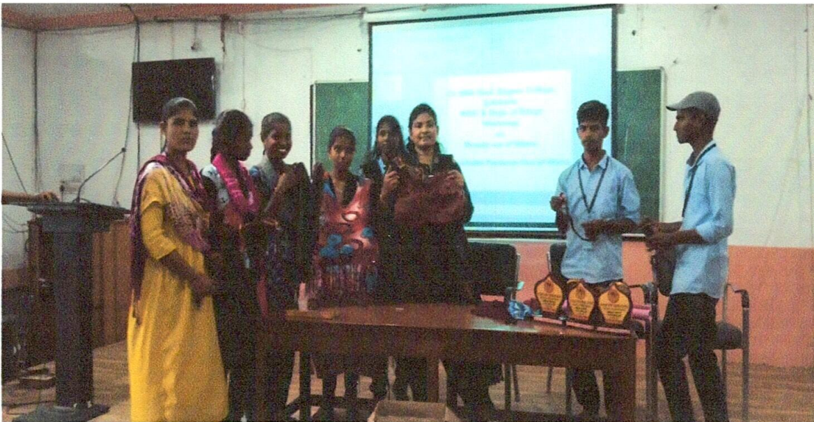
Showing bags prepared out of Jeans Pants by not using thread and needle.(Instant cloth bags)