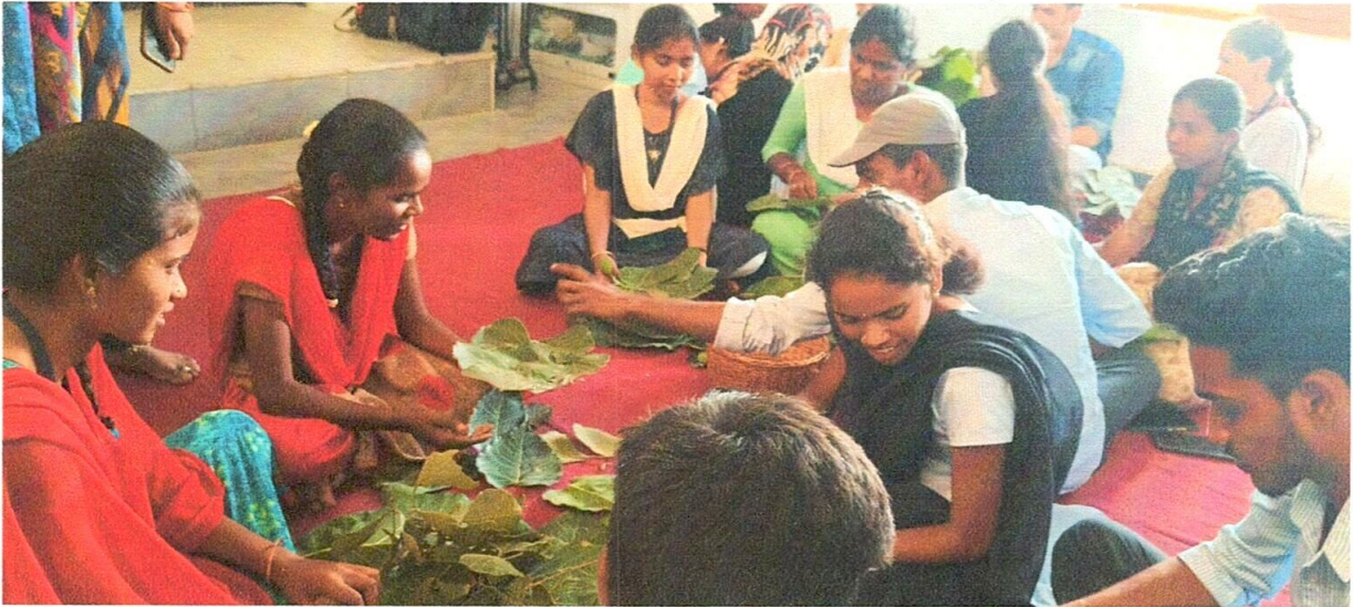
Students are enjoying the team work