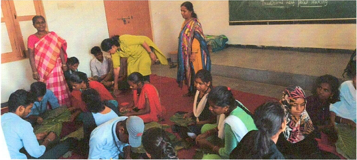
Principle doctor apia chinamma madam inspecting the workshop