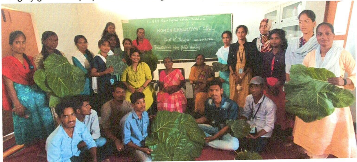
Proud team with their eco friendly green plates