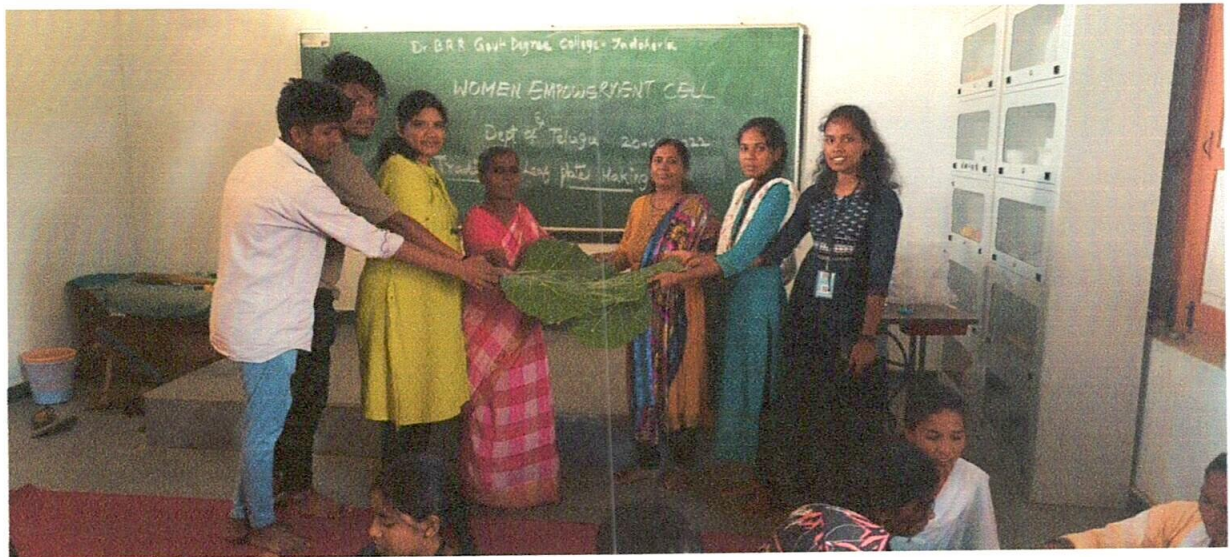
Ours is also... a big plate.....Team - 2