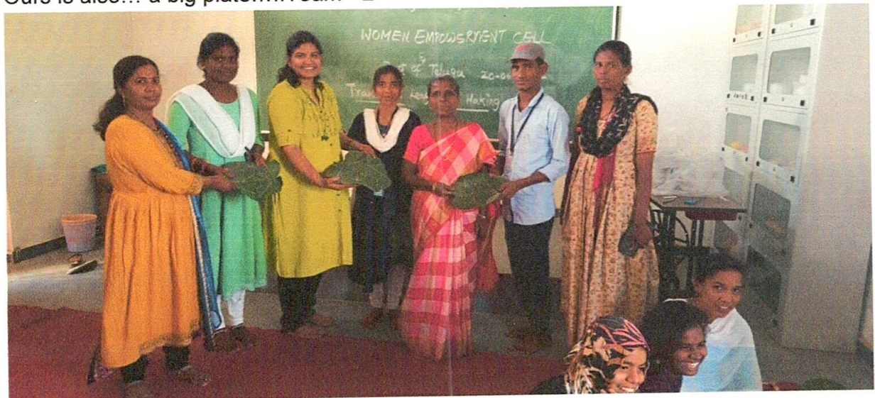
With tiny green plates 3rd team