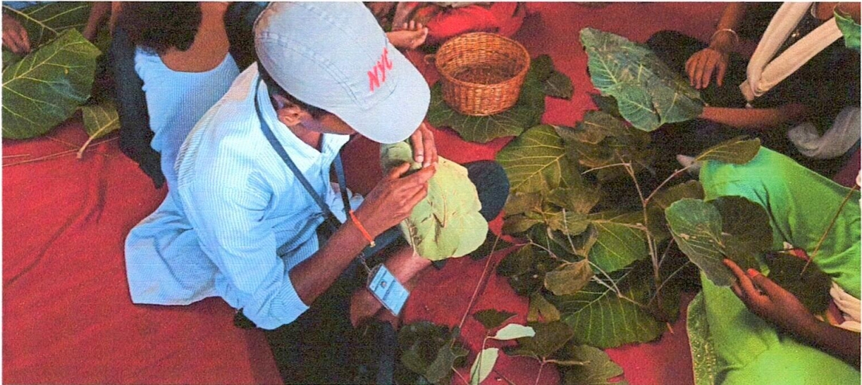
Students stitching traditional green leaf plate