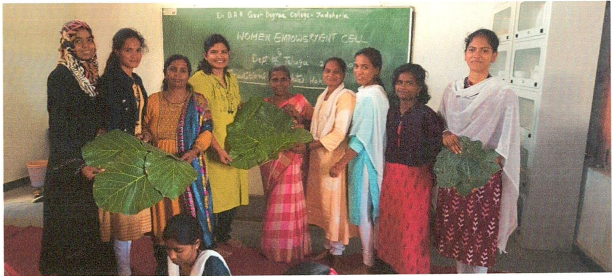
Naughty girls team prepared traditional green leaf plate in the shape of Telangana state