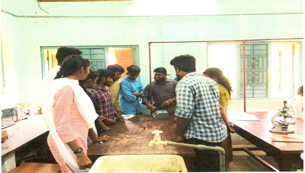
Hands on Program