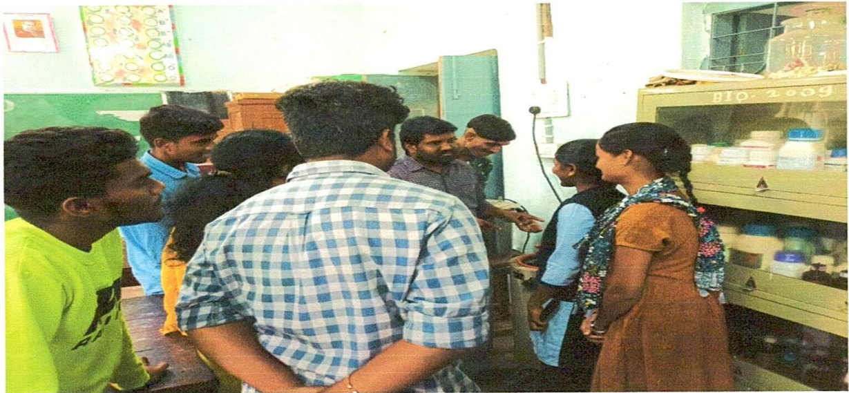
Hands on Program