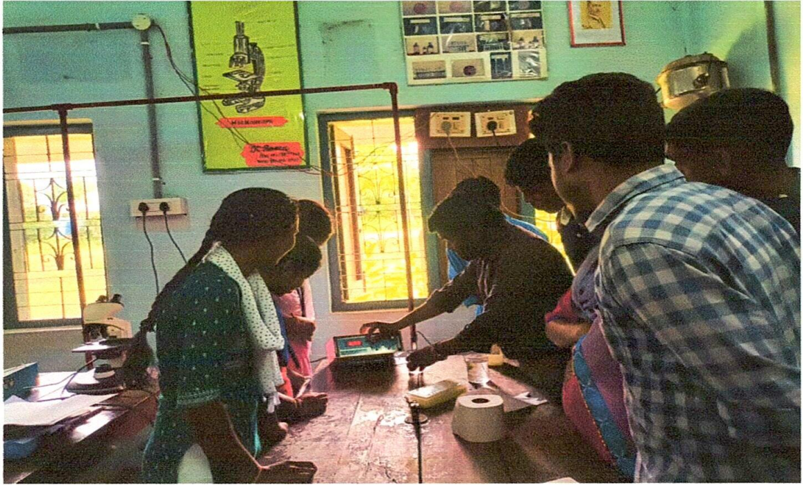
Hands on Program