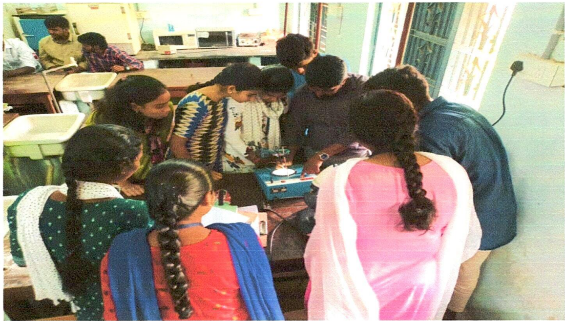
Hands on Program