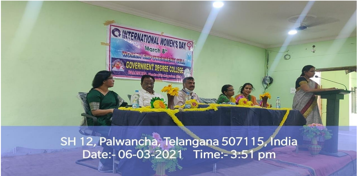
SH 12, Palwancha, Telangana 507115, India Date:- 06-03-2021 Time:- 3:51 pm