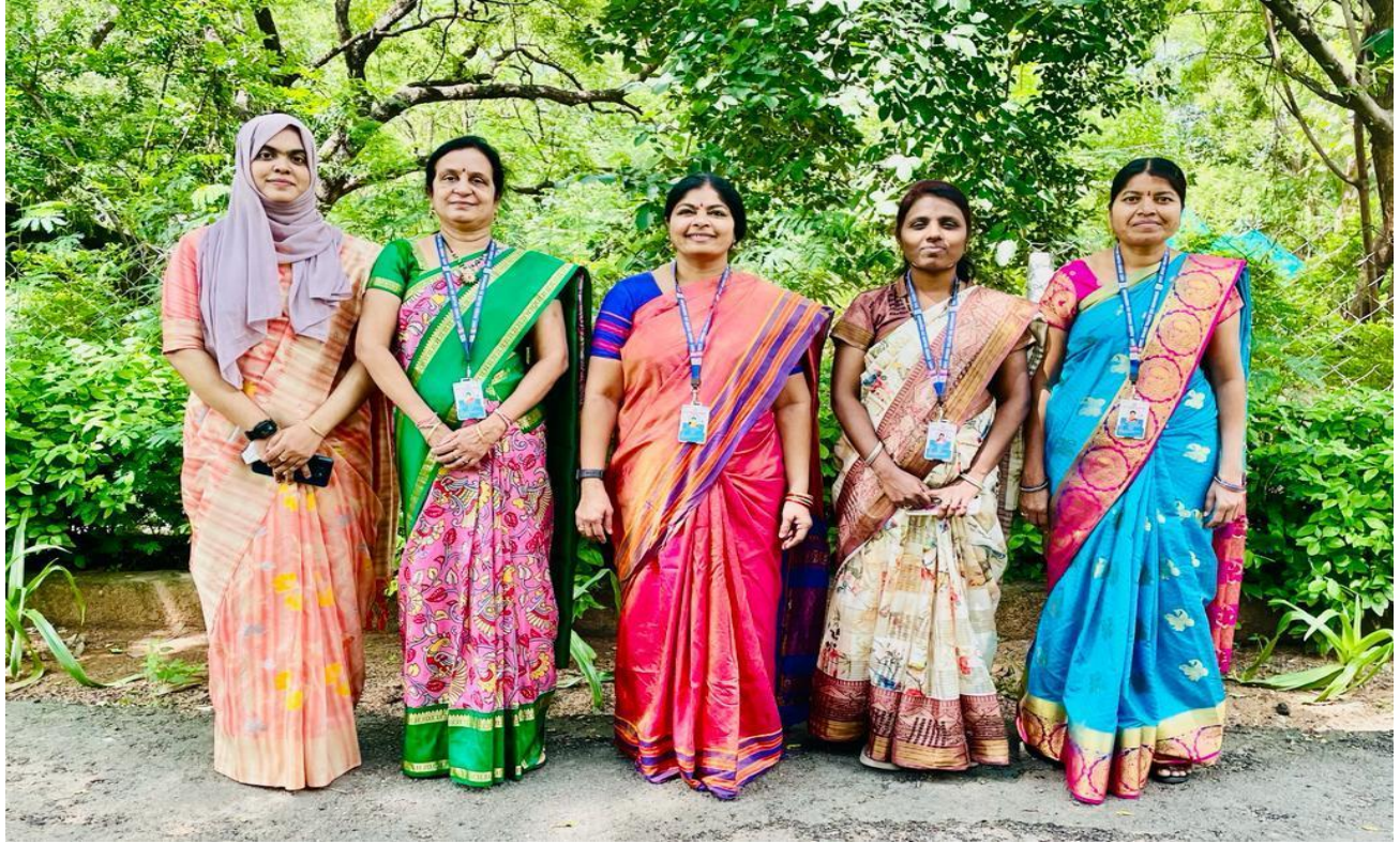
DEPARTMENT OF ZOOLOGY FACULTY WITH PRINCIPAL