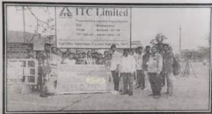
ITC Sarapaka 5 th Unit