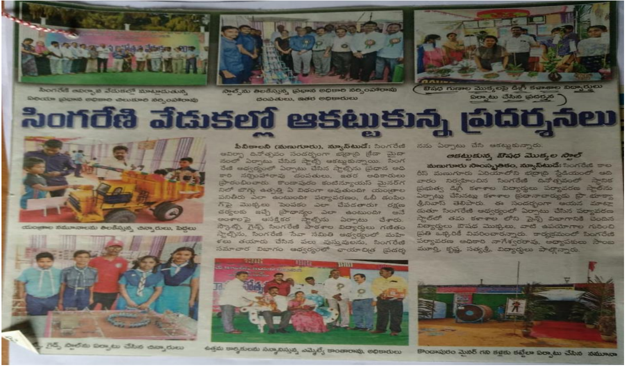
The students & faculty of GDC, Manuguru, participated in “Mining day celebrations at Singareni Collieries and put the stall of Medicinal plants and their therapeutic uses.