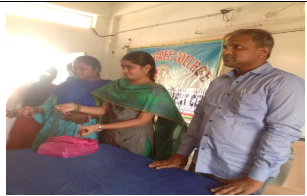
Distribution of Stationary Items to the Girl Students on the occasion of International Women's Day