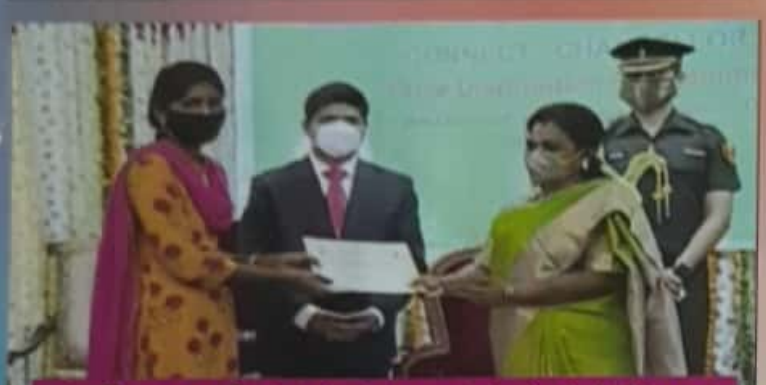
🚪 గవర్మర్ గాలి నుండి ప్రశంసాపత్రం అందుకుంటున్న మన విద్యాల్ది