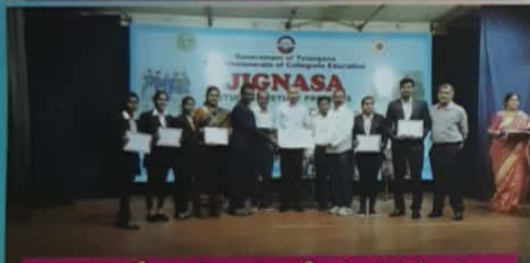
జిజ్తాస లో రాష్ట్ర స్థాయి మొదటి బహుమతి ప్రధానం