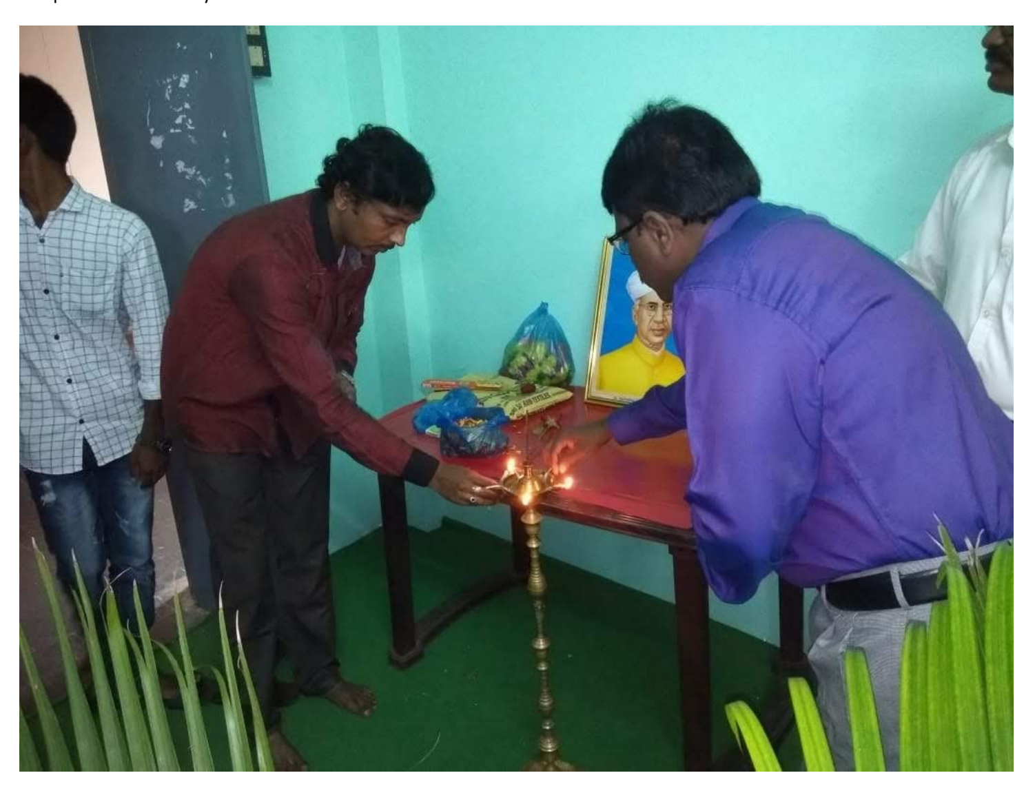
3 Department of English " English Language Day " \,