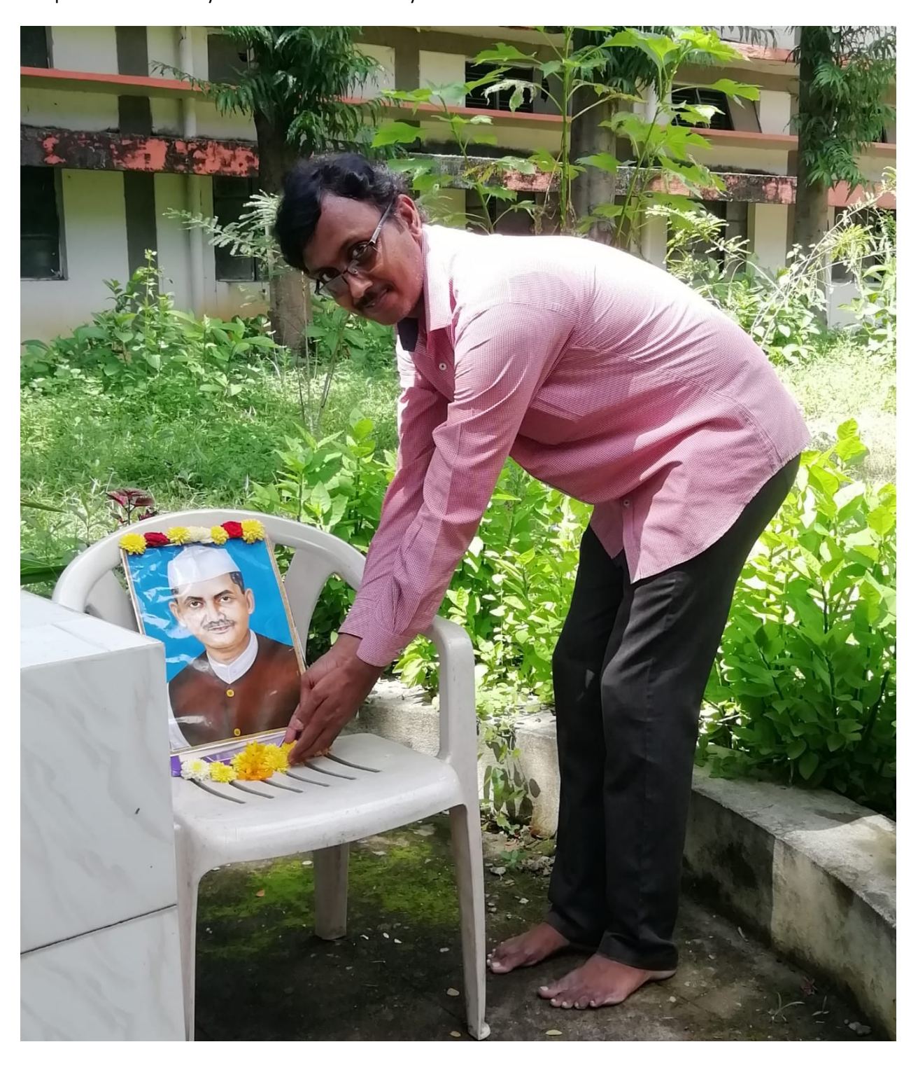
4 Department of History "Lal Bahadur Shastri Jayanthi"