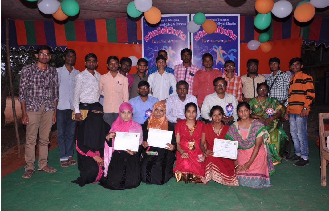
Yuvatharnagam Cultural Events Prize Distribution At SRGOVT.A&S COLLEGE