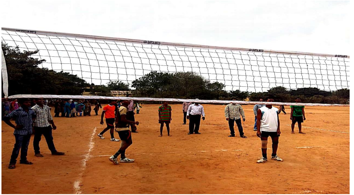
yuvatharangam collegelevel Volley Ball Match dt24/01/2017