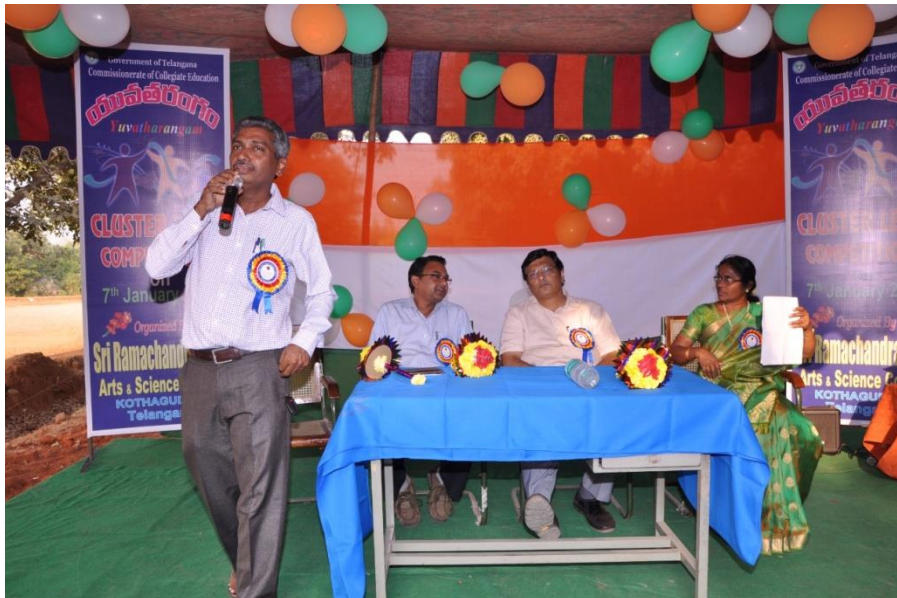
Yuvatharnagam Cultural Events Inauguration session