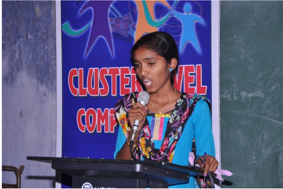
YUVATHARANGAM CULTURAL EVENTS (SINGING COMPETITION)