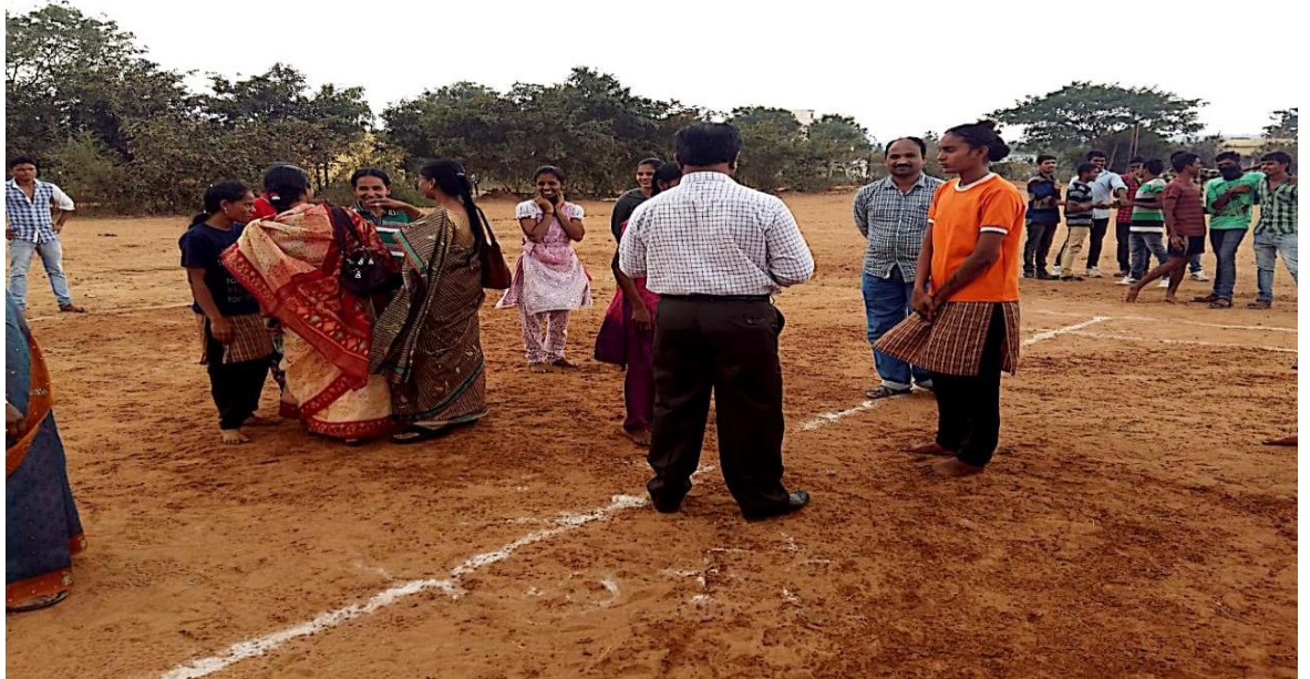
yuvatharangaam kabaddi competition on 24/01/2017