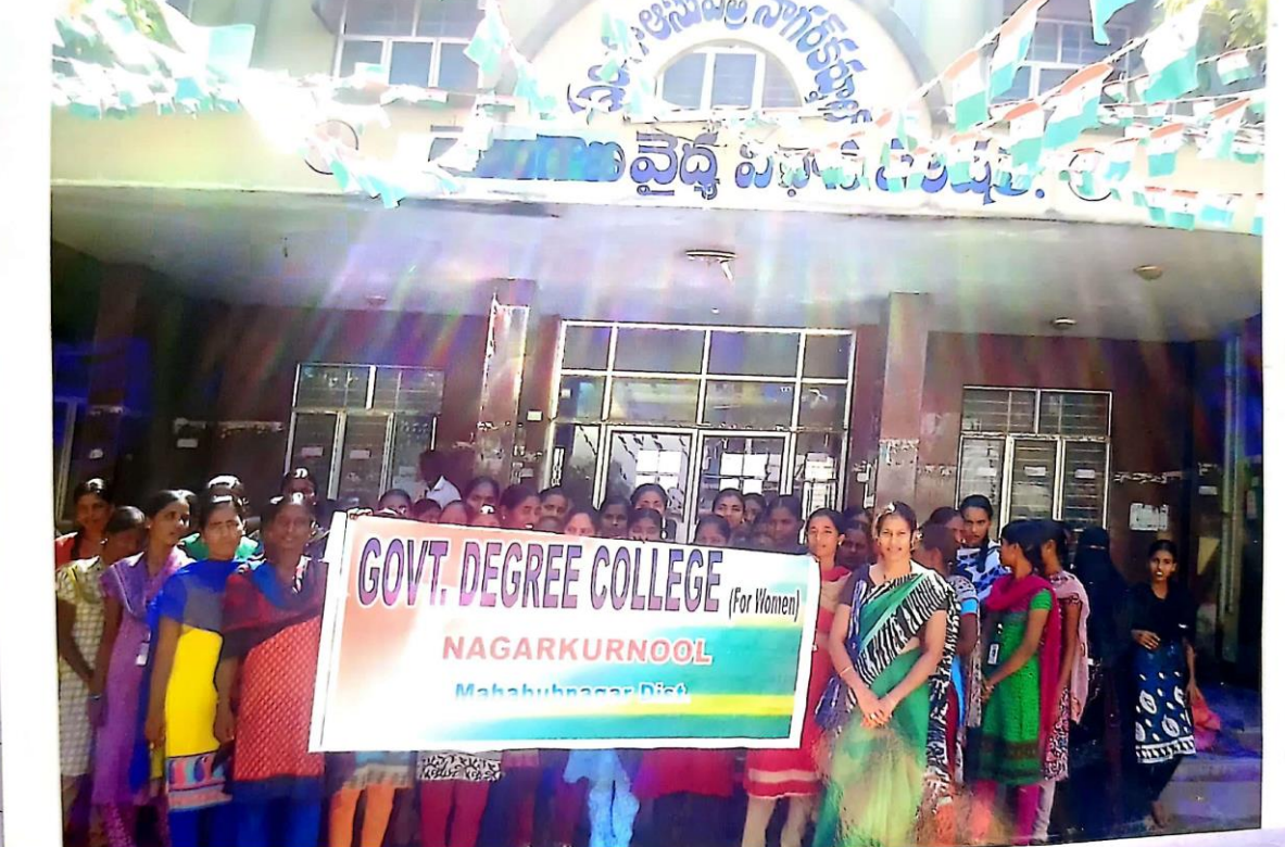
scanned with CamScanner