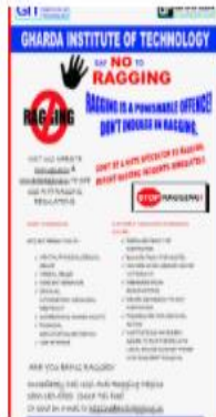
Antiragging Documents... git-india.edu.in