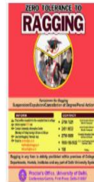
Anti-Ragging - Delhi Uni... du.ac.in