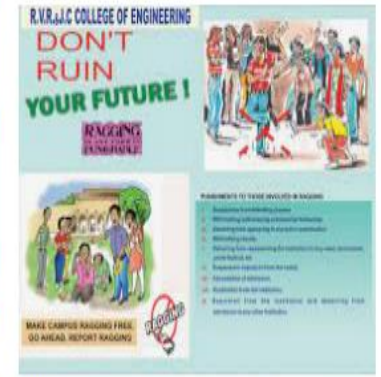
Welcome to RVR & JC College of Engg rvrjce.ac.in