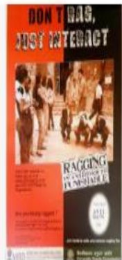
Anti Ragging Measures... griet.ac.in