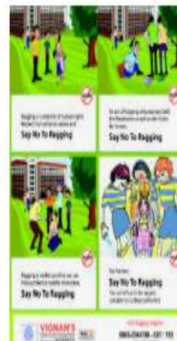
Anti-Ragging Posters vignan.ac.in