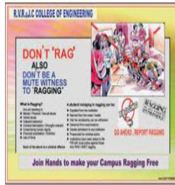
Welcome to RVR & JC College of Engg rvrjce.ac.in