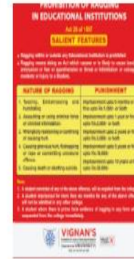
Anti-Ragging Posters vignan.ac.in