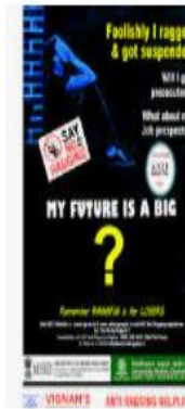
Anti-Ragging Posters vignan.ac.in