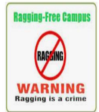
Anti Ragging Committee - St. Joseph's... josephscollege.ac.in