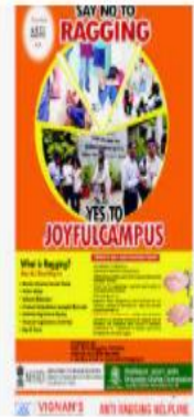
Anti-Ragging Posters vignan.ac.in