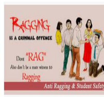
Metro College of Health Science and ... metrocollege.in