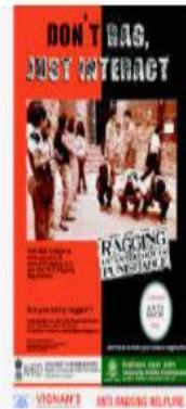
Anti-Ragging Posters vignan.ac.in