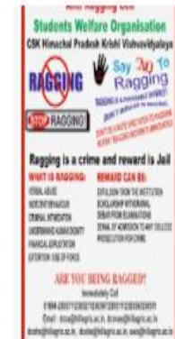
Anti Ragging hillagric.ac.in