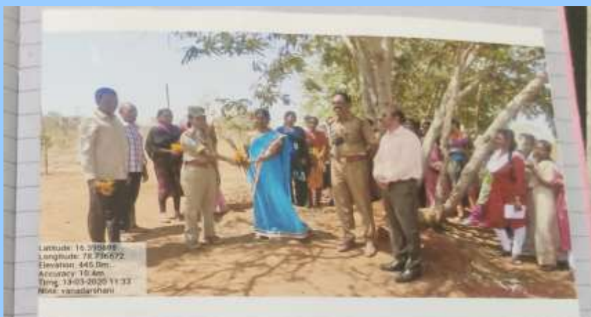
Wild Fruit bearing Plantation Rangapur