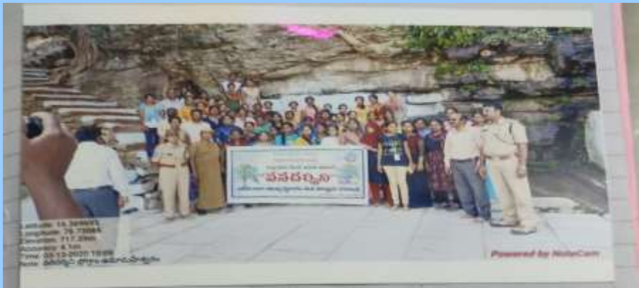
At Uma maheshwaram