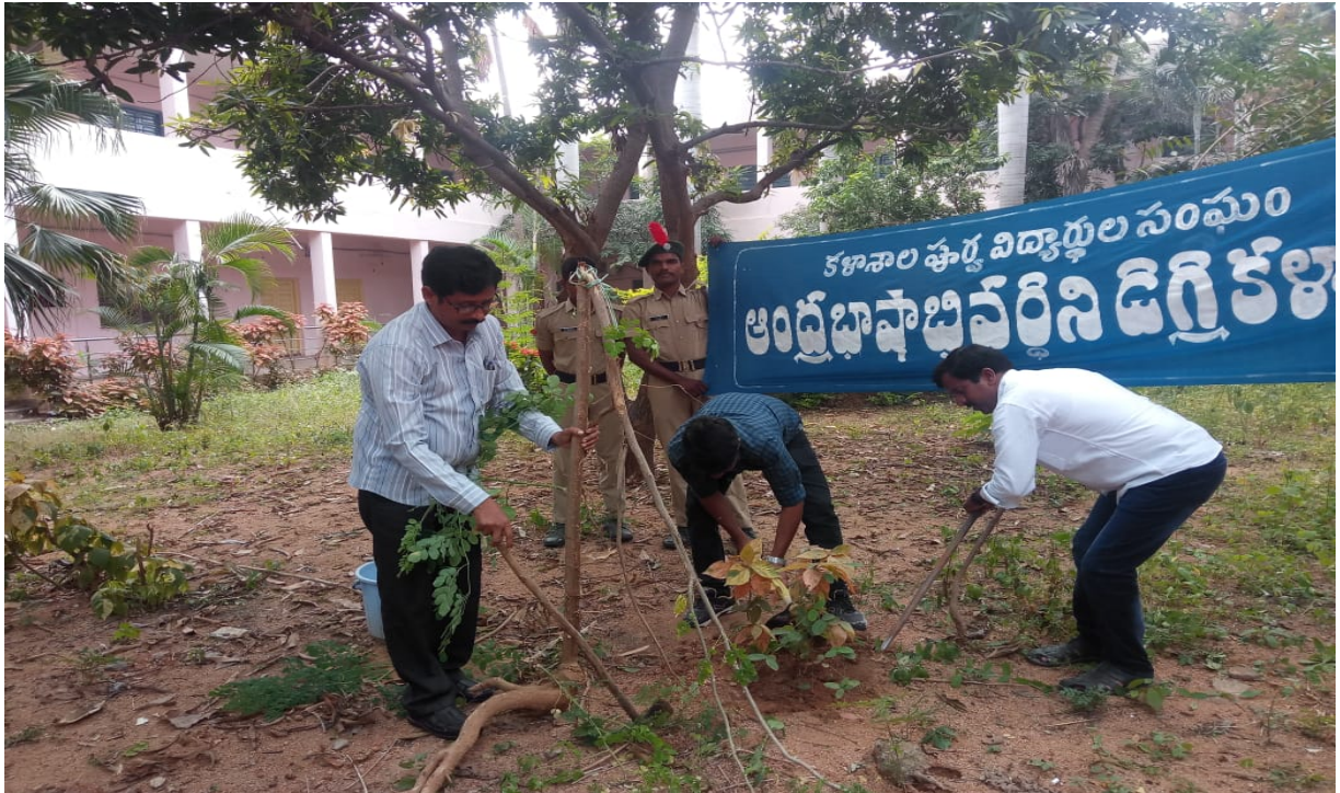
SWACH BHARATH BYALUMNI ASSOCIATION MEMBERS ON 25.07.2015