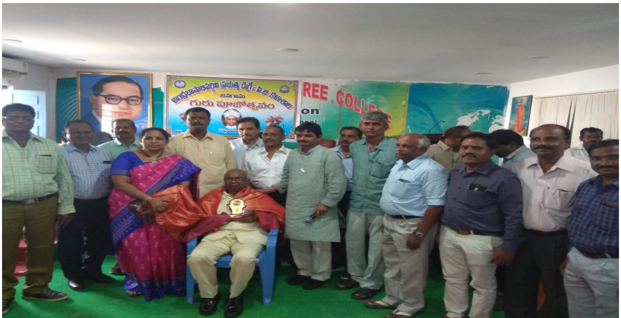
HANOURING THE EXPRINCIPAL BY ALUMNI ASSOCIATION ON TEACHERS DAY 05-09-2018