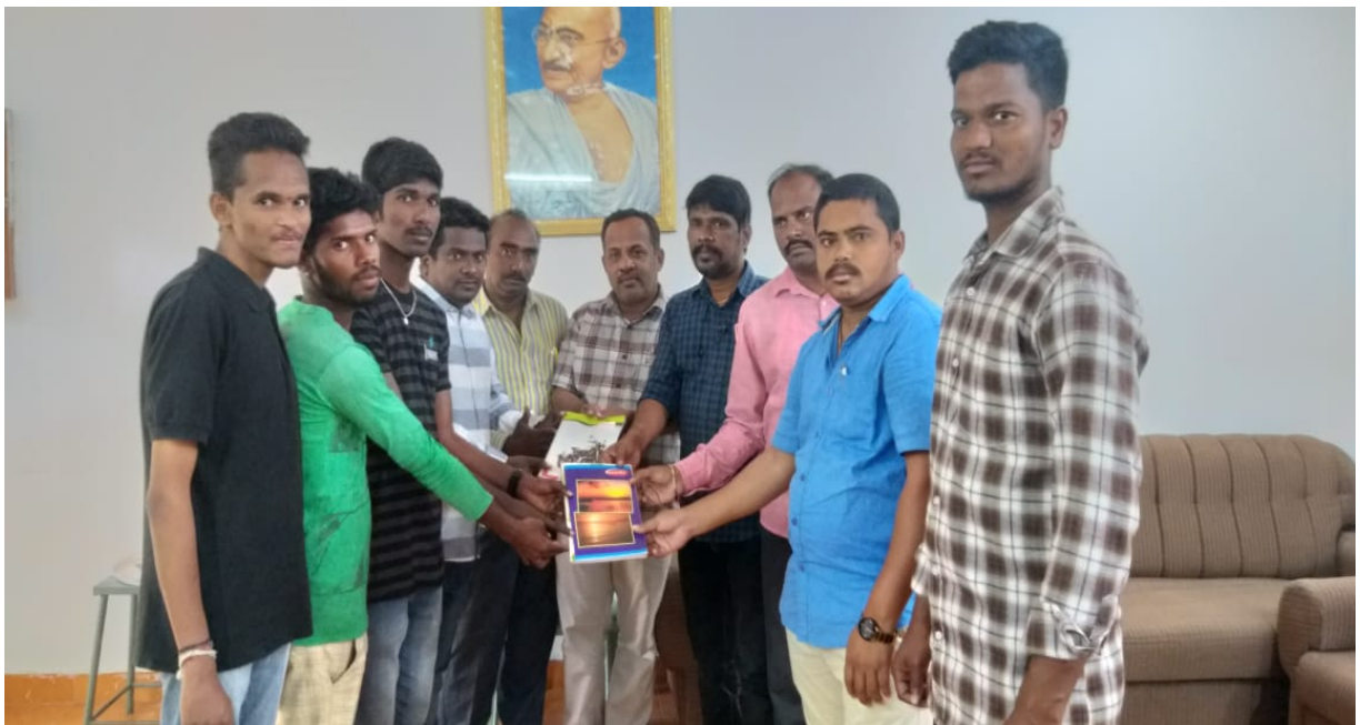
NOTE BOOKS AND STUDY MATERIAL DISTRIBUTION TO STUDENTS ON 08-08-2015