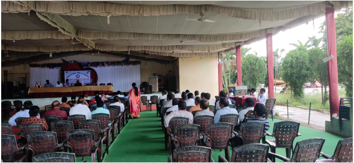
ALUMNI ASSOCIATION MEETING IN GAYATRI GAURDENS NEAR BY COLLEGE ON 8.3.2016