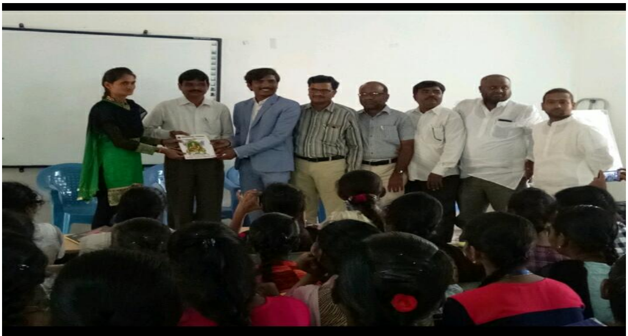
COMPETITION BOOKS DISTRIBUTION TO POOR STUDENTS ON 05-04-2019