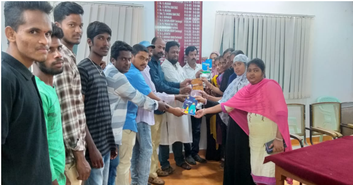
DISTRIBUTION OF PRINTED MATERIAL FOR COMPETITIVE EXAMINATIONS BY ALUMNI ASSOCIATION ON 09-03-2017