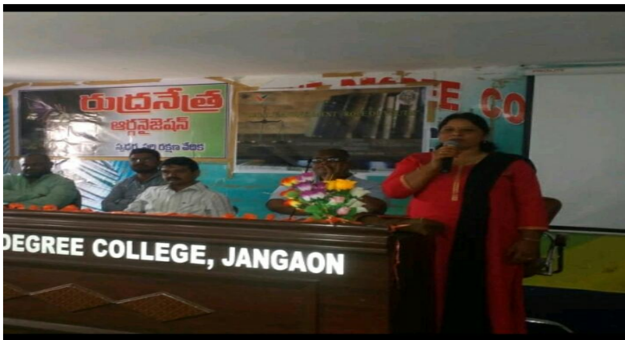
AWARENESS PROGRAMME ON WOMEN PROBLEMS IN THE SOCIETY ON 04.11.2017