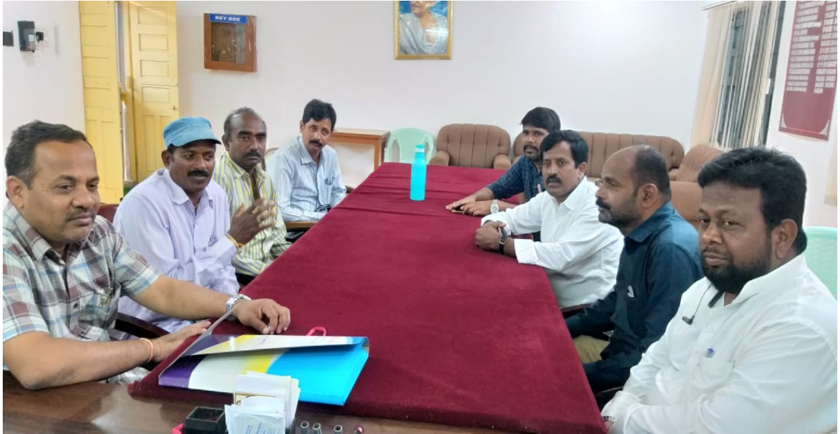
ALUMNI ASSOCIATION MEETING IN PRINCIPAL CHAMBER ON 16-02-2018