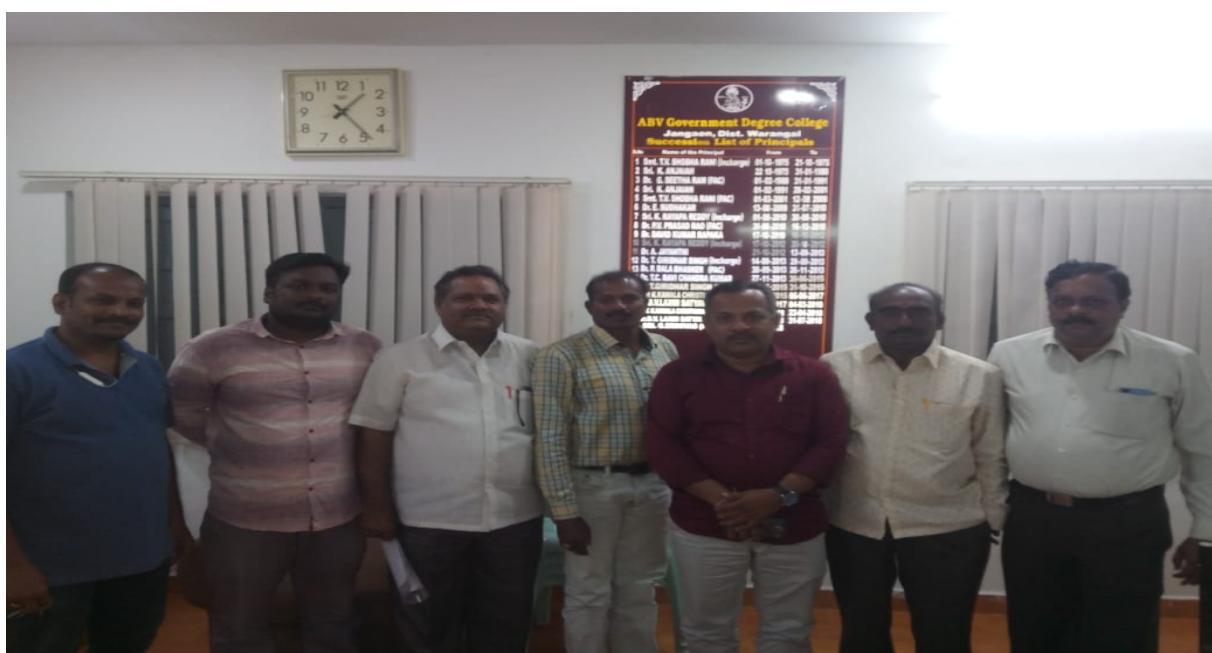
PROMINENT MEMBERS OF ALUMNI ASSOCIATION MEET ON 12.03.2019