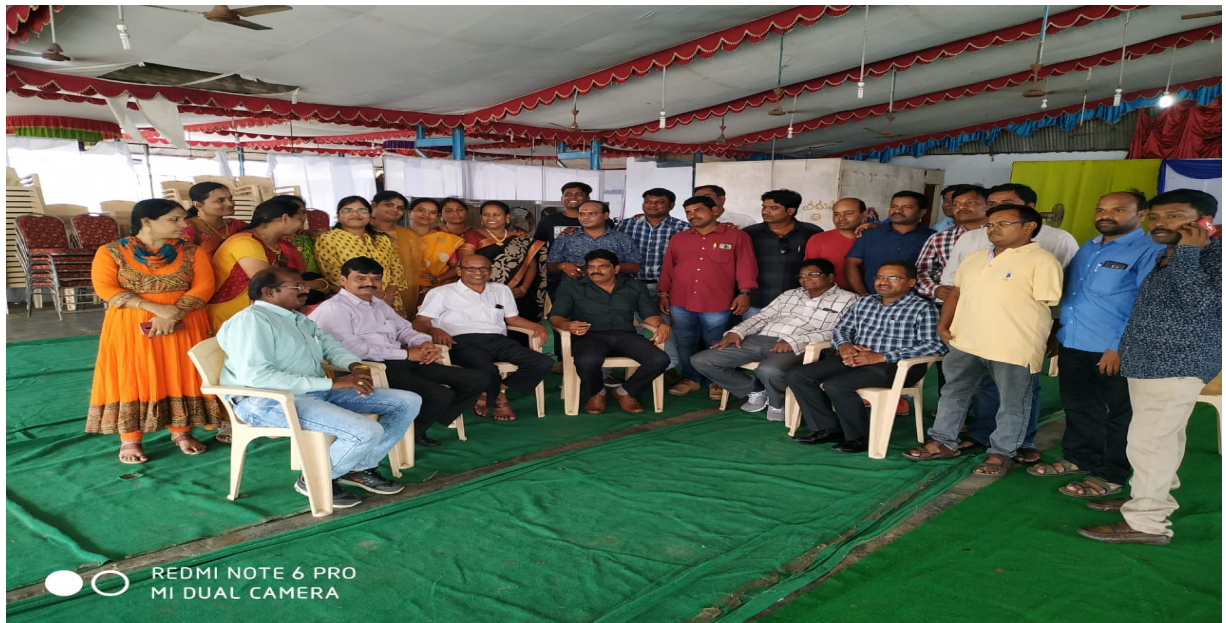
AULMINI ASSOCIATION MEET ON 23.06.2014