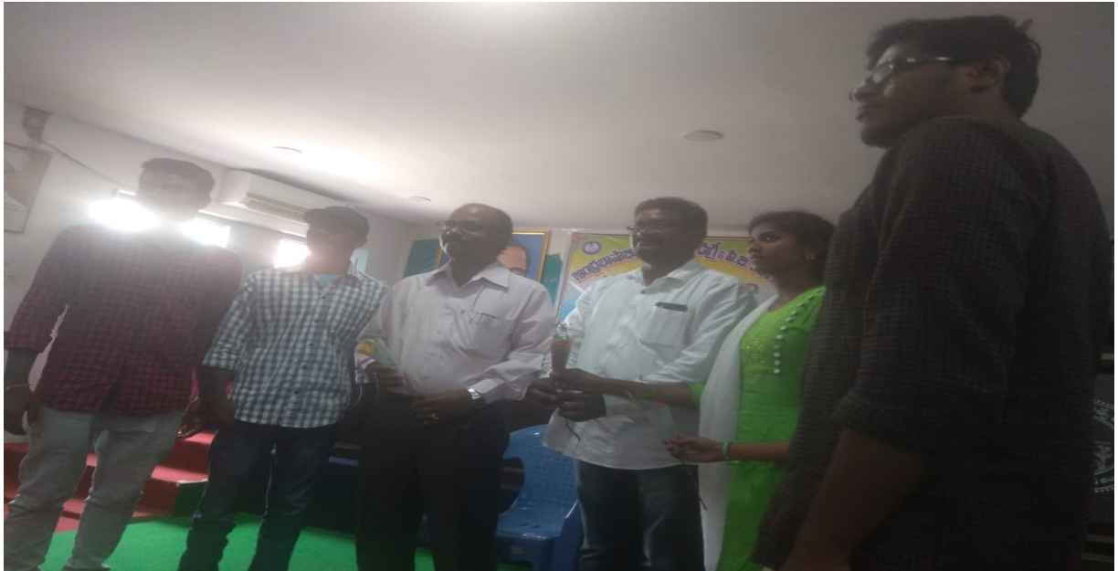
DISTRIBUTION OF MEMENTOS TO COLLEGE TOPPER STUDENTS BY ALUMNI MEMBERS ON 05-04-2019