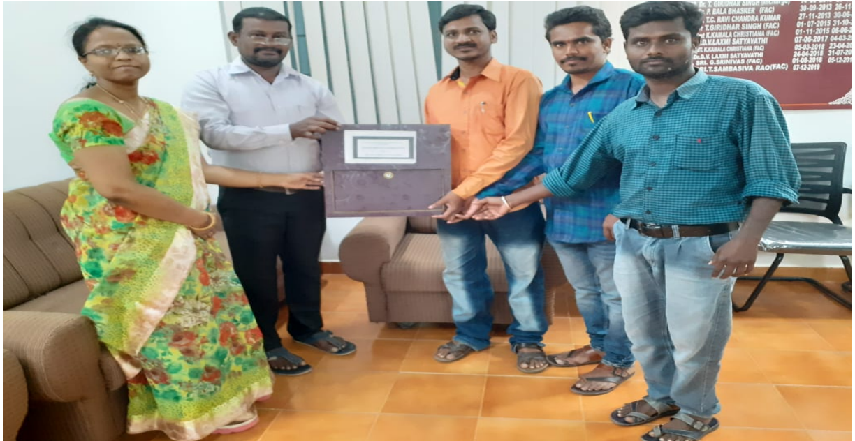
DONATING AN INTERNAL COMPLAINTS BOX TO COLLEGE BY THE ALUMNI MEMBERS ON 12.11.2014