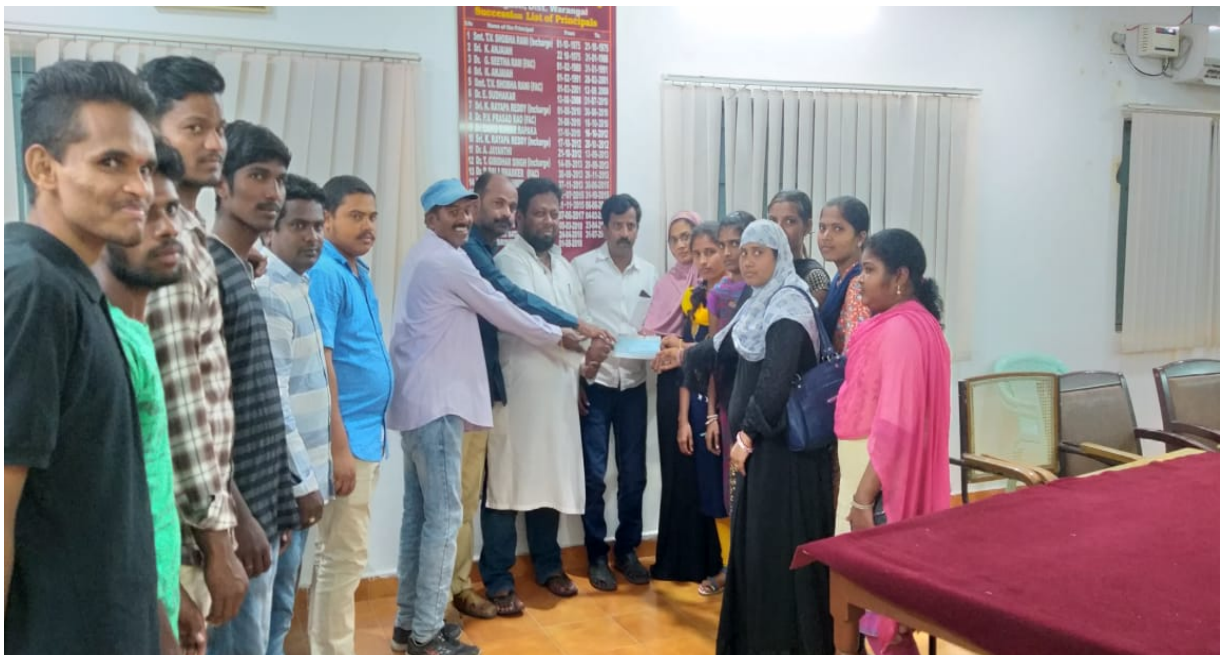
CASH REWARD TO POOR STUDENTS BY ALUMNI ASSOCIATION 05-04-2016