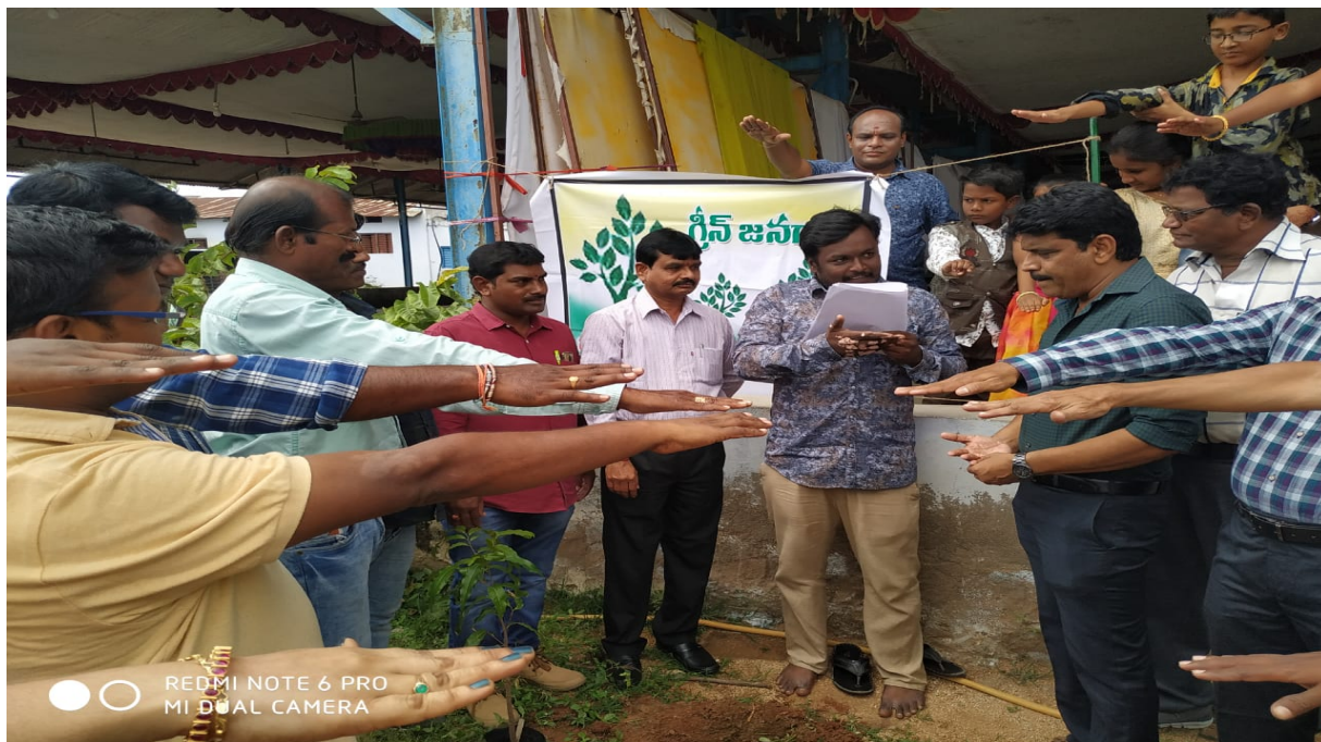
TAKING OATH FOR DEVELOPMENT OF PLANTATION IN JANGAON TOWN BY ALUMNI ASSOCIATION ON 25-06-2017