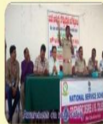
4 - NSS Units in the social service