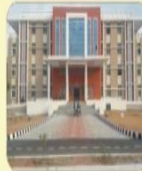
Splendid Hostel Building