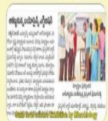
Workshop on National Integration Camp

Press coverage clips of national / state level seminars and work shops conducted during the academic year 2018- 2019 depicts our college standards