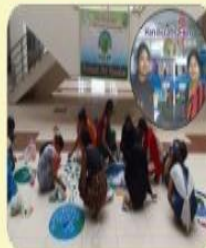
Rangoli for Eco Awareness