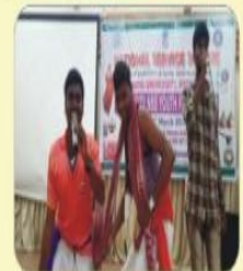
NSS volunteers performing in youth festival