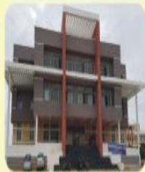
Magnificent College Building