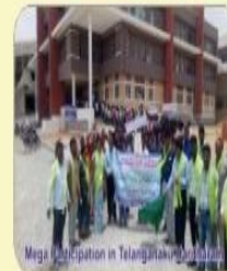
NSS Volunteers in service of the Nation