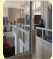
Futuristic e-office block