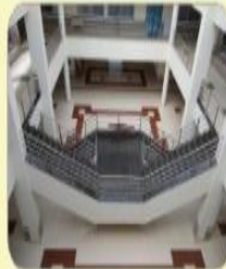
Elegant Inner View