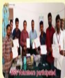
In National Integration Camp