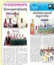
Workshop on National Integration Camp