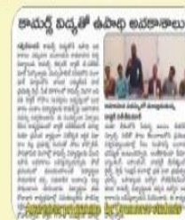
Workshop on National Integration Camp