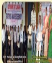
Honour for Faculty members