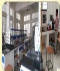
Sophisticated Science Laboratories with digital boards