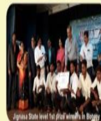
Jignasa State level 1st prize winners in Biology