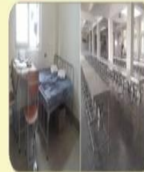
Hygienic Rooms & Dining facilities