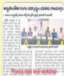
Physics state level workshop