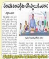
Workshop on National Integration Camp