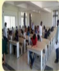
Spacious & Ventilated Class Rooms