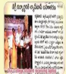
from commissioner for standing top in University