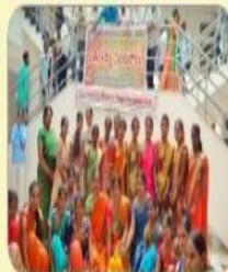
Reflecting and promoting Telangana Culture