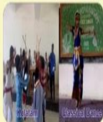
Students participating in Cultural Activities