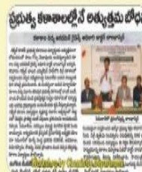
Workshop on National Integration Camp