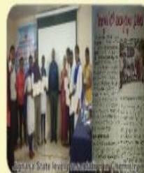
Jignasa - Project Based Learning to develop scientific attitude