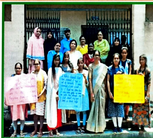
POSTER PRESENTATION ON ABUSING AND SEXUAL HARRASEMENT OF WOMEN