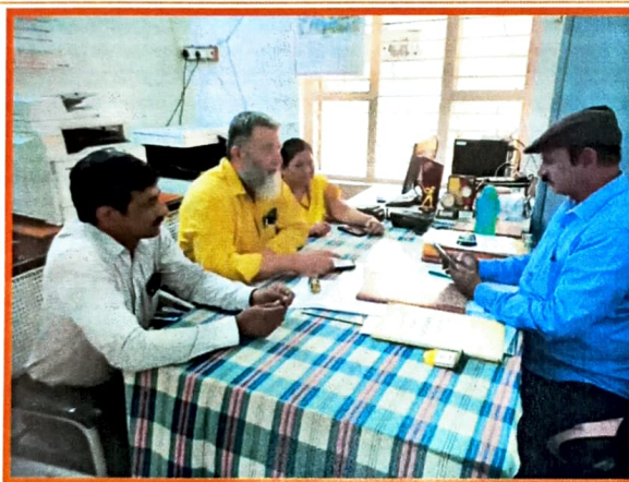
Grievance Redressal cell meeting in principal chamber

A few Photographic evidence of grievance redressed cell