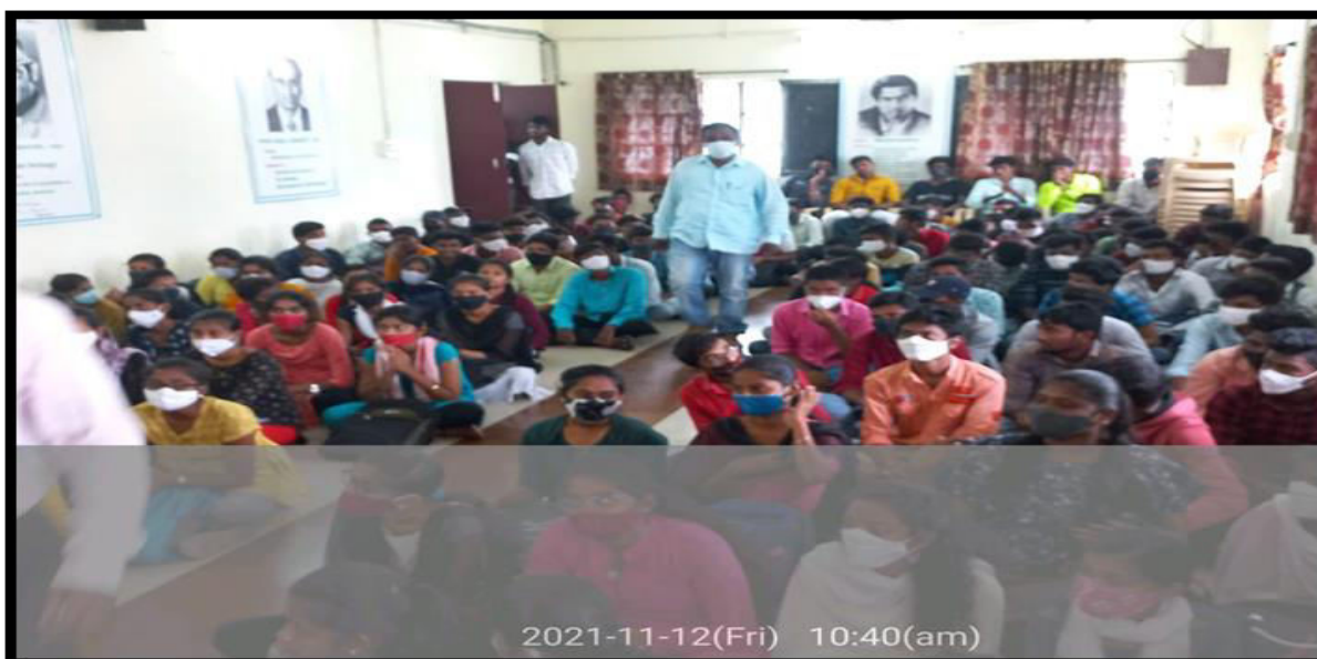
Induction Programme for science students