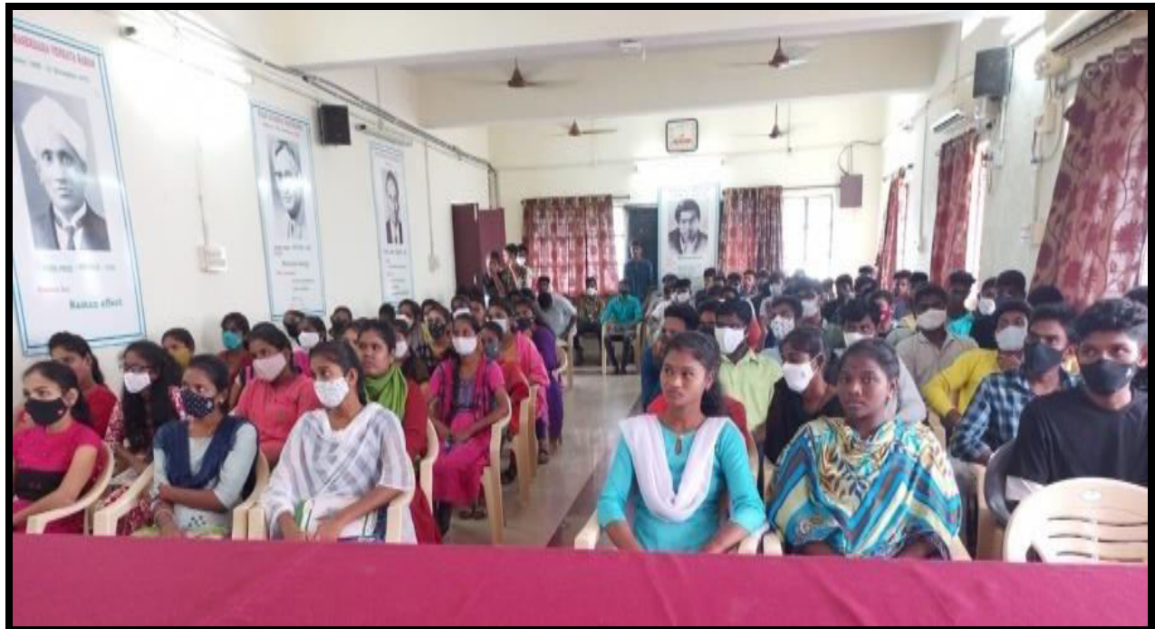
Induction programme for Arts students