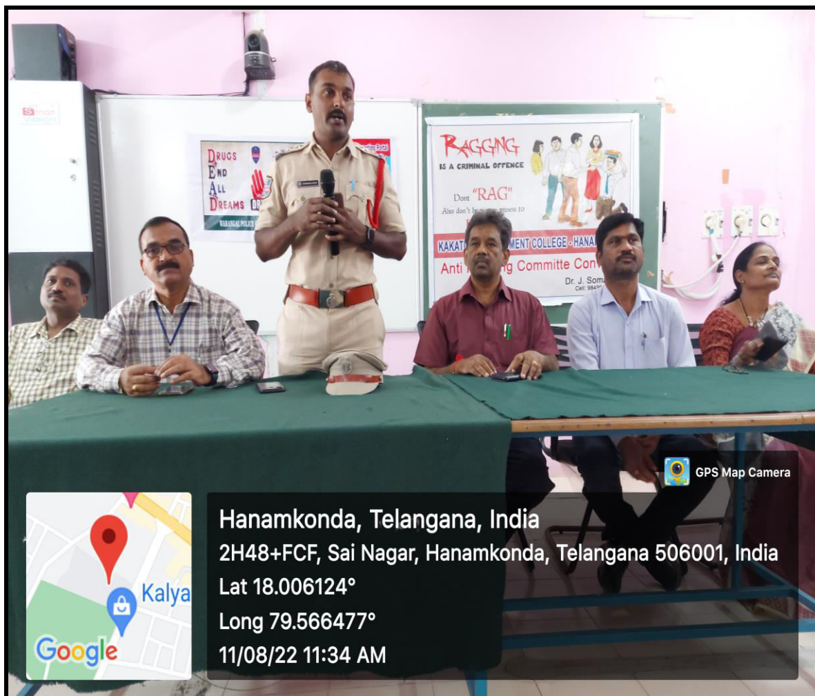
Police Inspector addressing the students

Outcome: The students are sensitized about the evil practice and the need to ban it