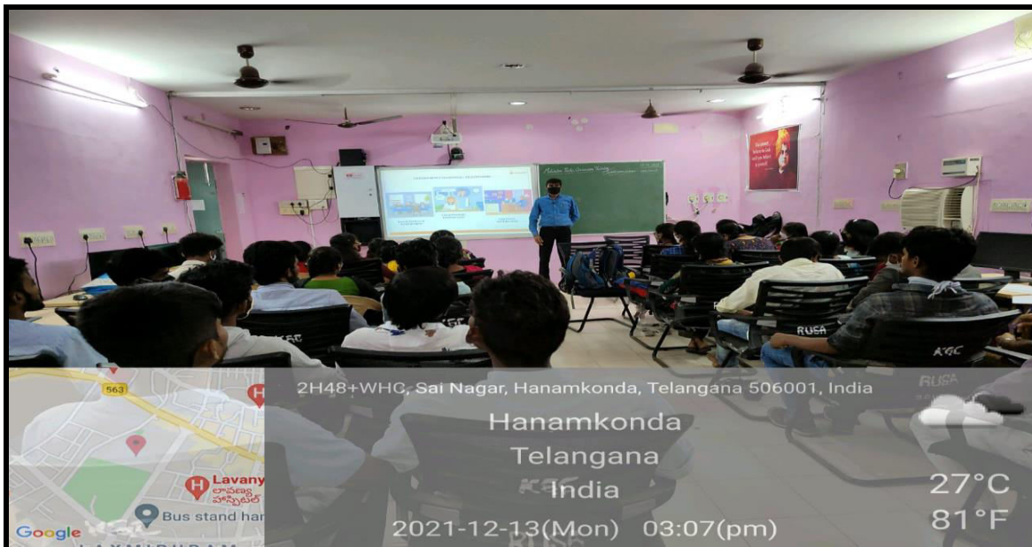
Resource person addressing the gathering