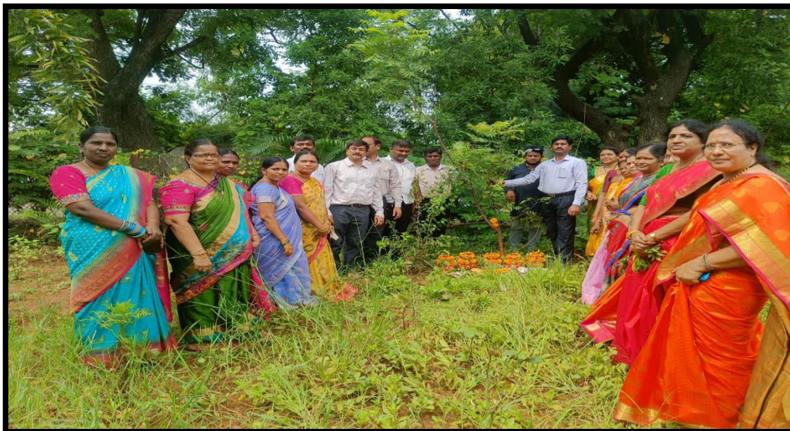
Staff participating at Bonalu fest