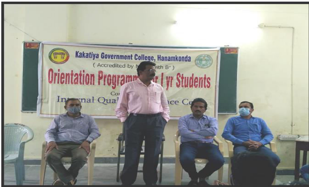
Induction Programme for Commerce students