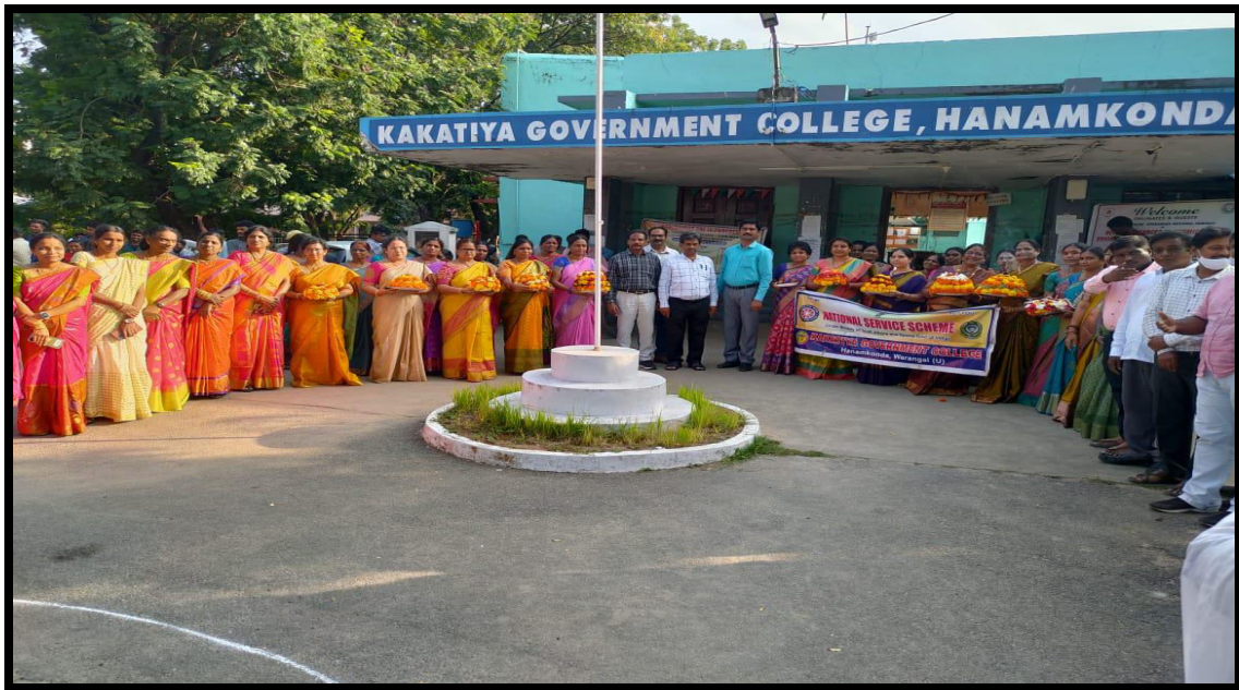
Staff participating in the Bathukamma festival