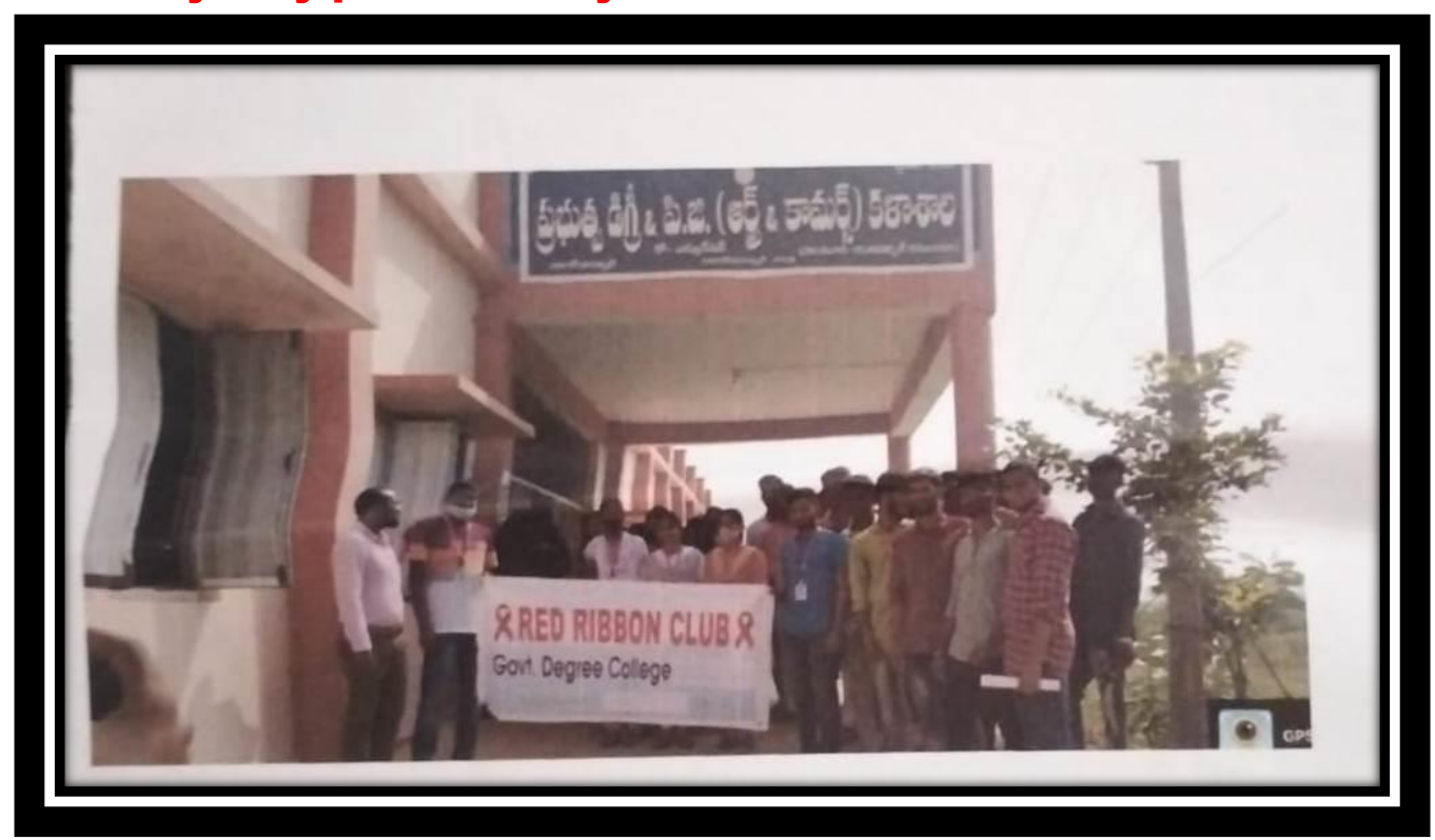
First Aid Awareness Programme Photo Gallery