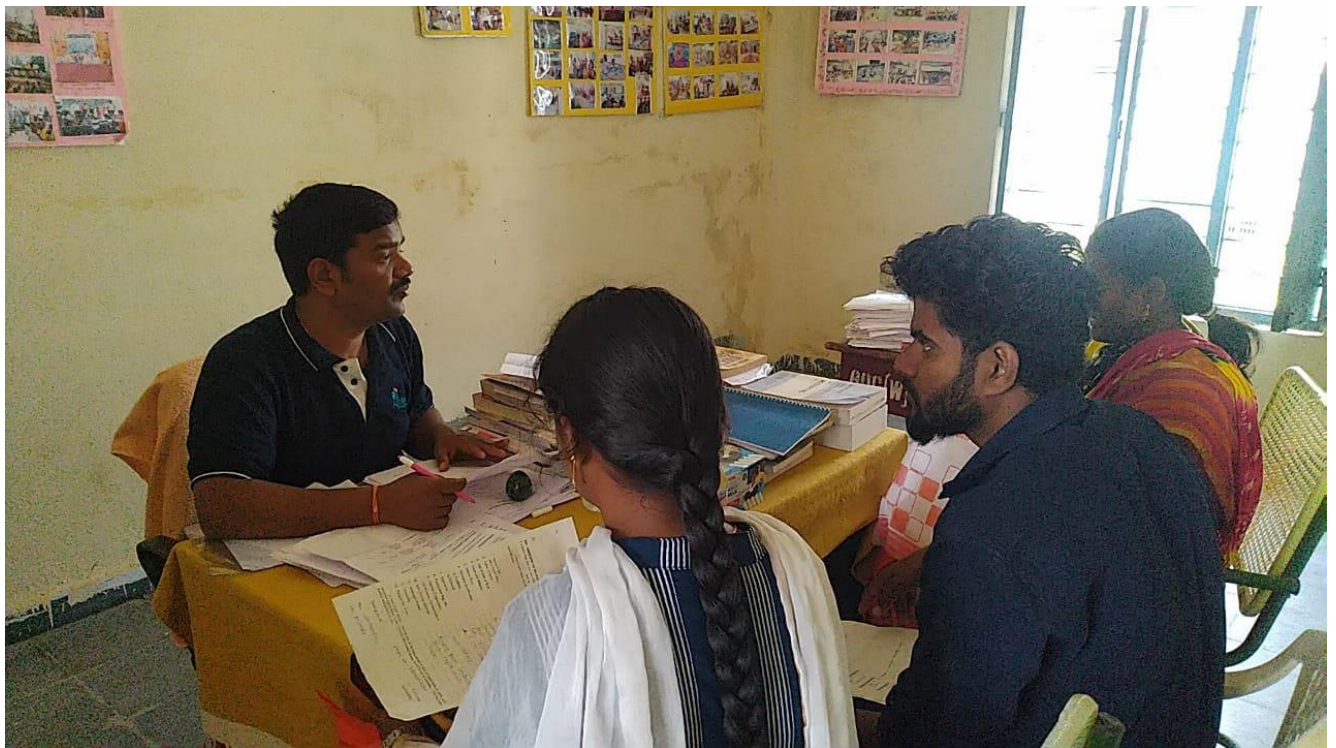
Interviews Conducting Apollo HR manager