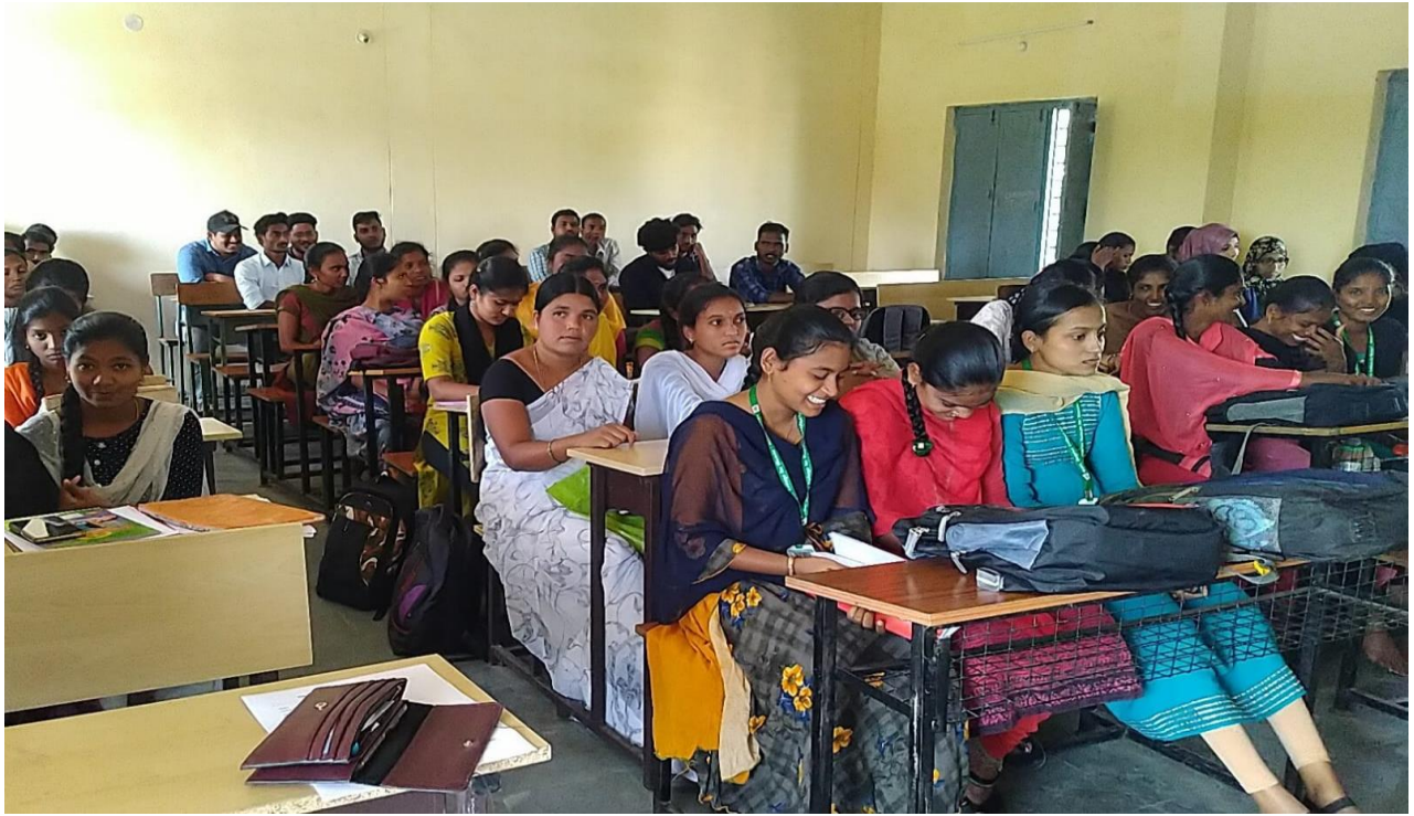
Students Listening the Speeches