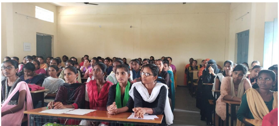
Students listening interestingly Speech