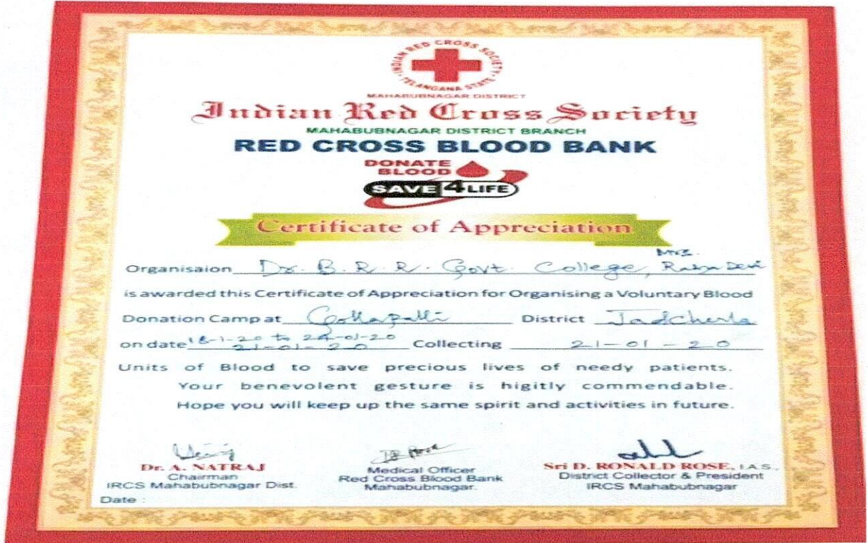
Appreciation certificate from Indian Red Cross for Blood Donation camp Organised at Special Camp at Gollapally