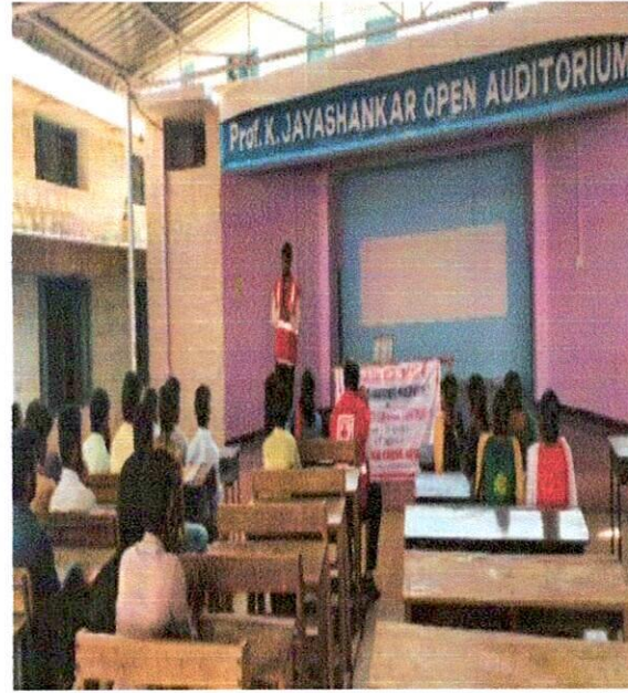
Volunteers involved in the training.