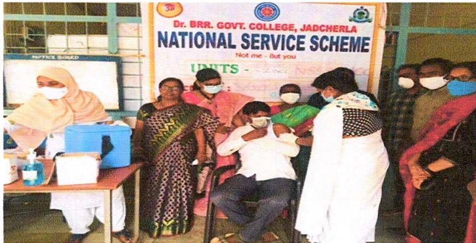
Our staff member availing vaccine