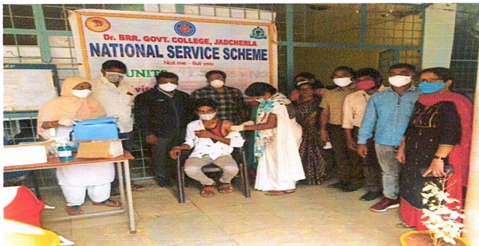
Students taking vaccine in a friendly and hygienic environment.