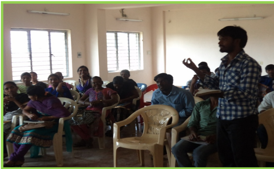
Group discussion on the topic of “ Indian Tax structure ” on 24/9/2016