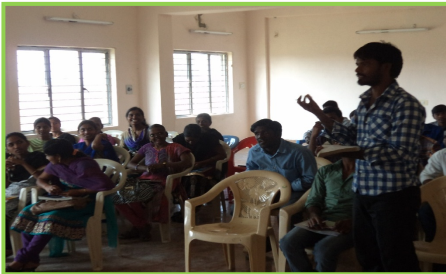
Group discussion on the topic of “ Indian Tax structure ” on 24/9/2016