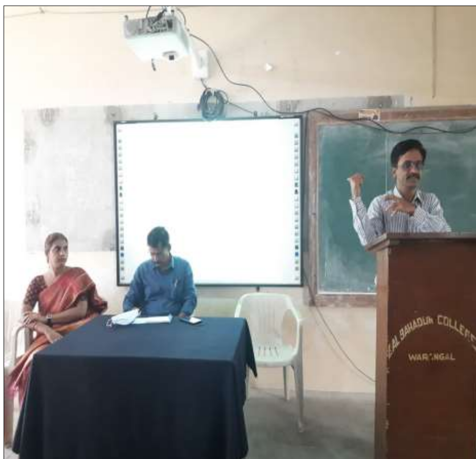
Extension Lecture at Lal bahadur College, Hanamkonda as part of Collaboration on 29.08.2018