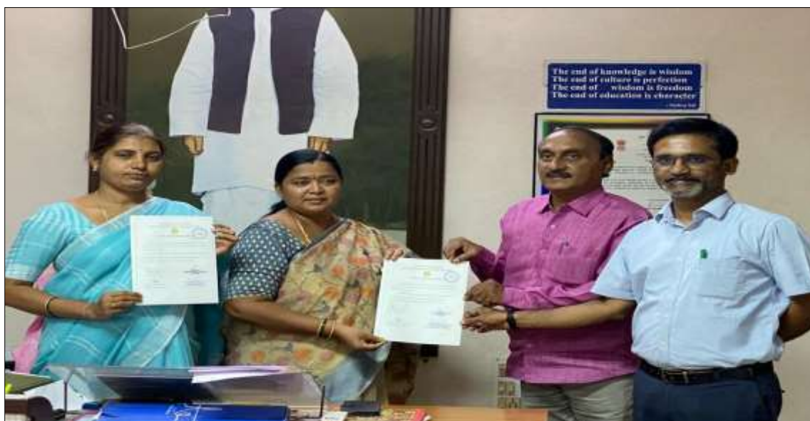
Collaboration agreement with LB College, Warangal