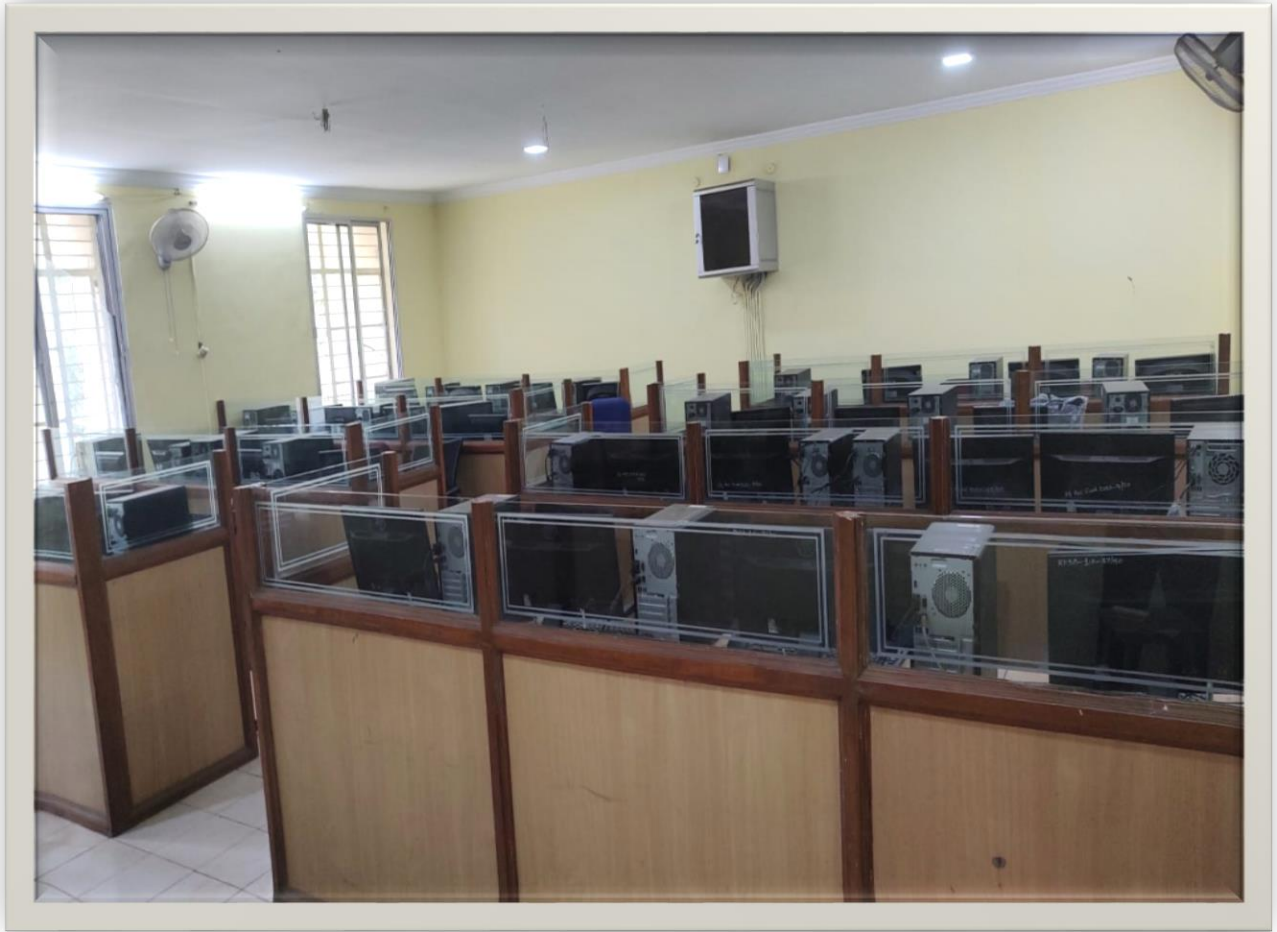
Lab with Latest Systems