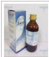
Ascocoff Cough Syrup