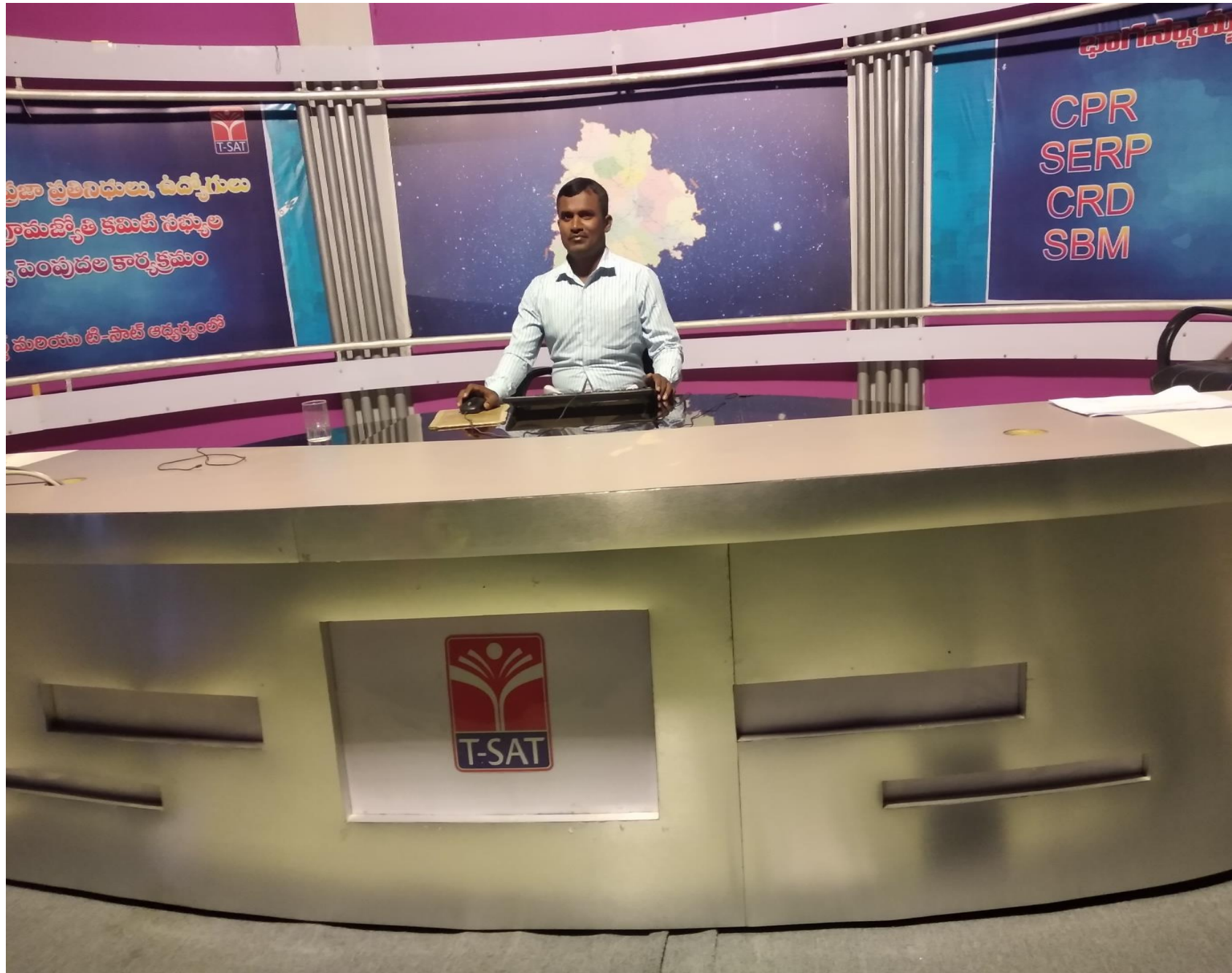
T- SAT Live Presentation