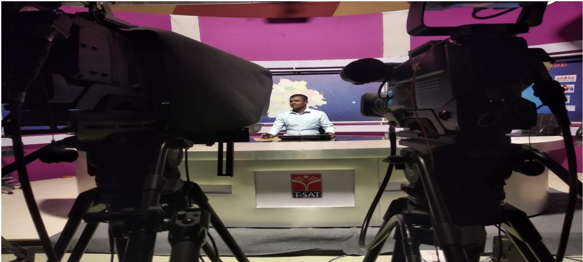
T- SAT Live Presentation