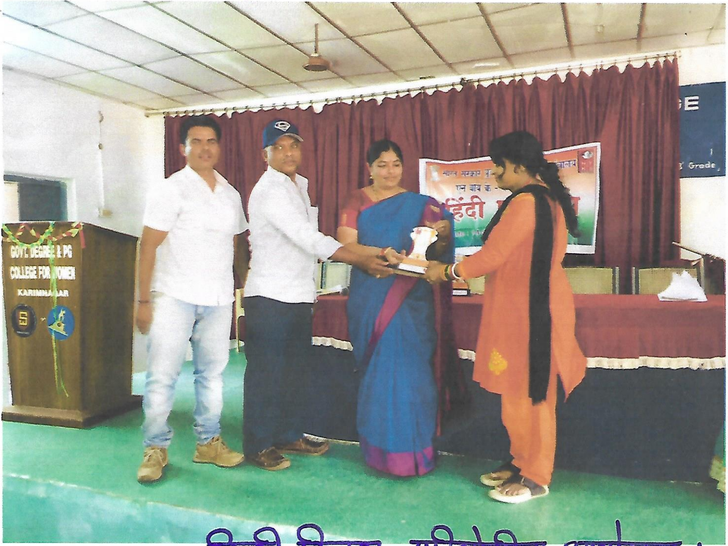
हिन्दी दिवस प्रतियोगिता आयोजन ।