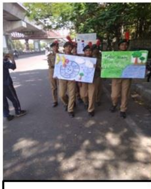
WATER CONSERVATION DAY