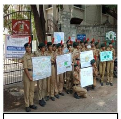
WORLD ENVIRONMENT DAY