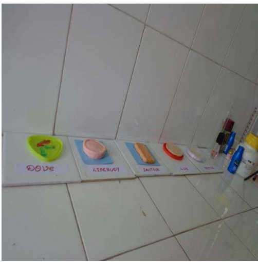
Prepartion of Soap, Eye Liner, Chalks and Lipstick