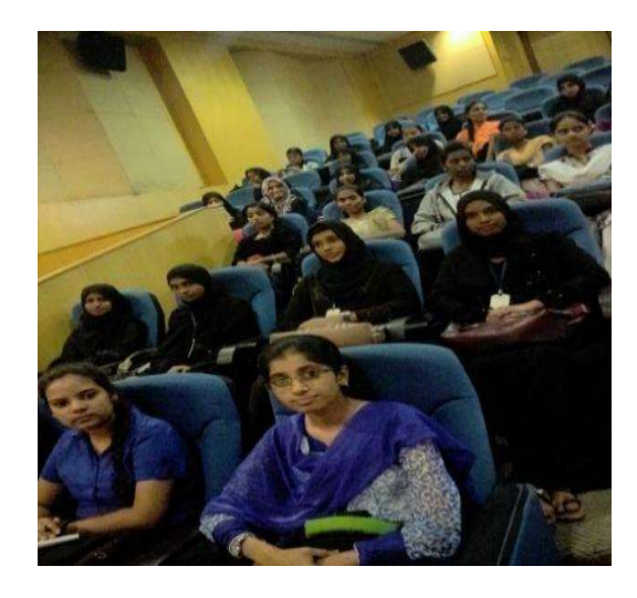
Students Participating in the programme