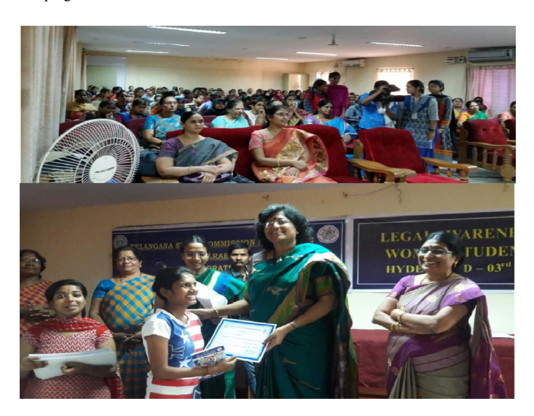
Students Receiving Certificates

The Two Day Workshop on Legal Awareness Programme on Laws related to Women conducted by the Telangana State Commission has been a very good Awareness Programme for the Students as most of the students come from the Lower Strata of Society, they are ignorant of the laws existing for them. They areunfortunately vulnerable because of the circumstances they leave. It is also a fact that the social and economic conditions play a vital role in shaping their lives.