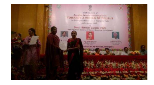
Faculty Members Receiving Certificates

Gender Sensitisation is introduced in our curriculum as one Credit Course with effect from this Academic Year i.e., 2016-17.