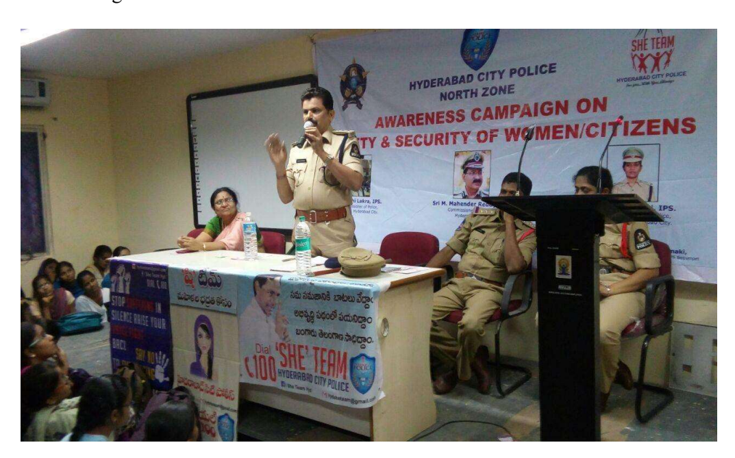
SHE Team Programme in the College

The majority of rapes occur in the victim's home. According to the Bureau of Justice, almost 40 percent of all rapes take place in the female victim's home. In the event that rape prevention fails—such as by avoiding problem areas or making sure a woman is never alone—the best chance for survival is to fight back. Fighting back is not just necessary, but it is a moral right because protecting one's self is paramount. The rest of the article will discuss why self-defense is important, some tools and techniques for effective self-defense, and information on gun use.