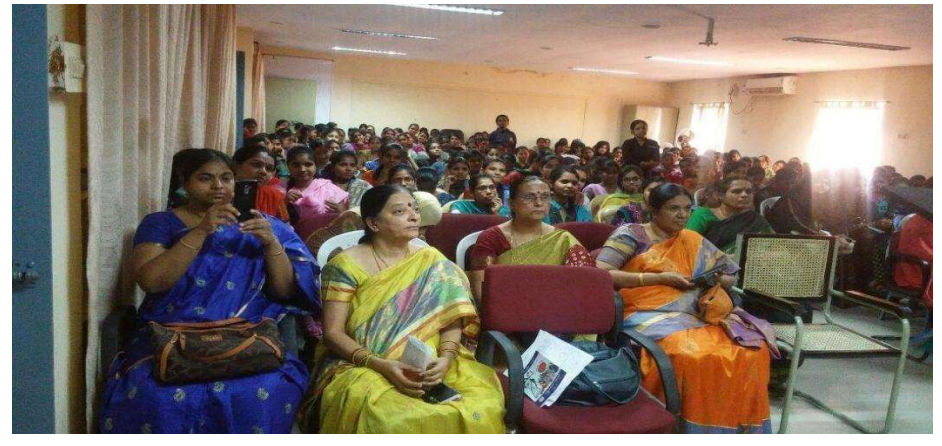
Staff and Students in the Valedictory Session