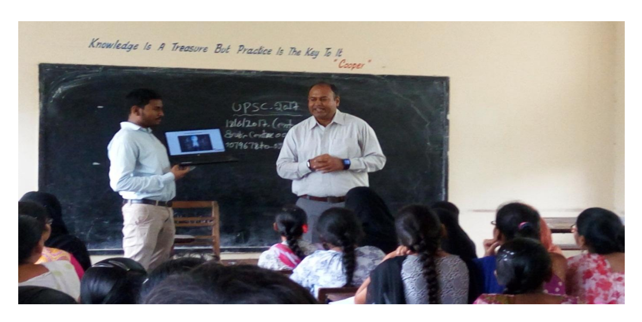
TRAINING FOR III YEAR STUDENTS IN SELF INTRODUCTION, JAM, GD, MOCK INTERVIEWS.