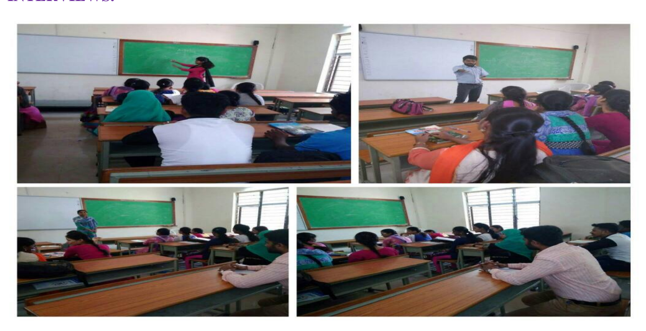
PRE DRIVE TRAINING ON 8^{TH} AND 9^{TH} MAY 2017 AT BJR GDC.