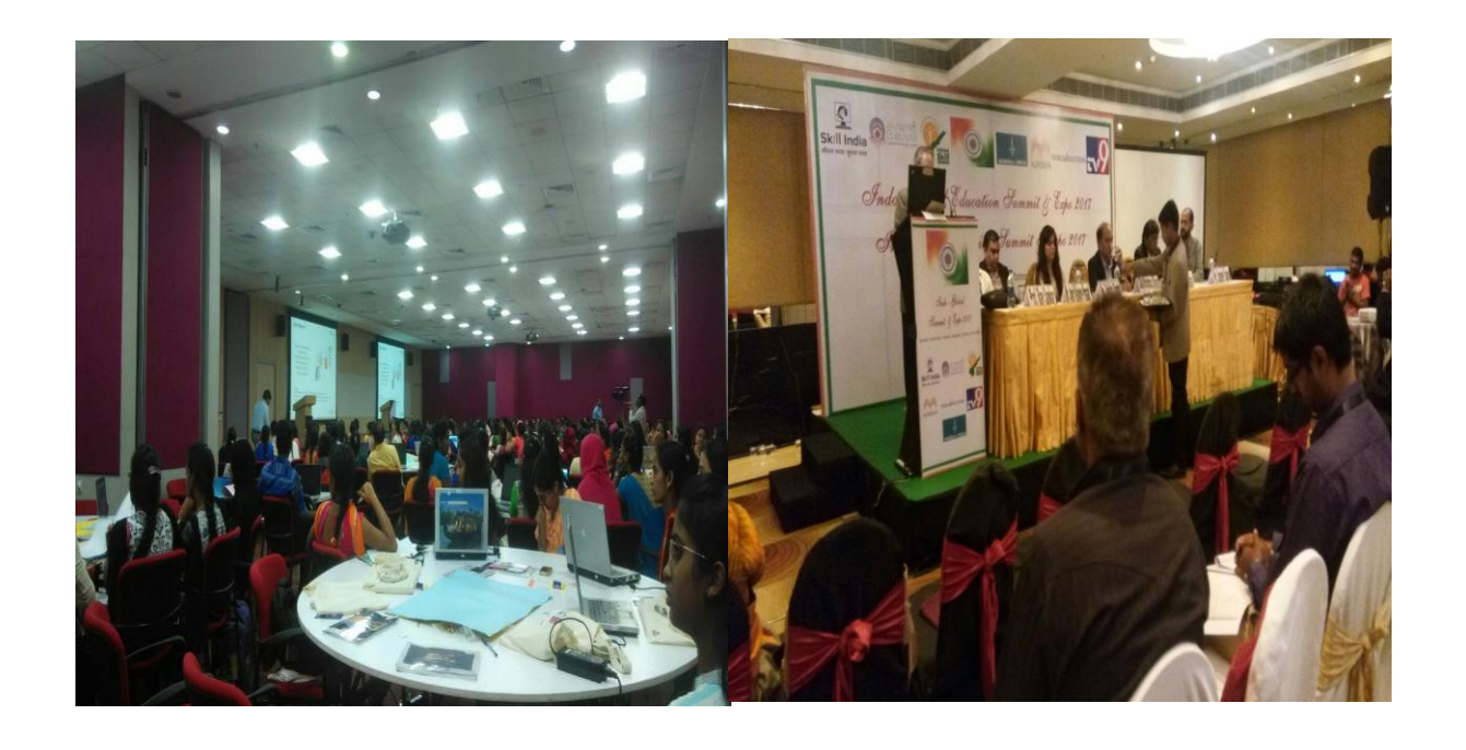
Organized by the Indus Foundation Hyderabad