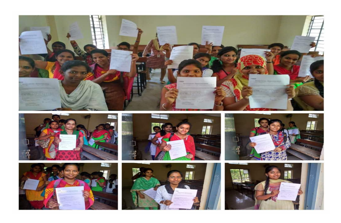
51 girls from GDCW Begumpet got letters of intent to go for further rounds @ HGS Pvt Ltd