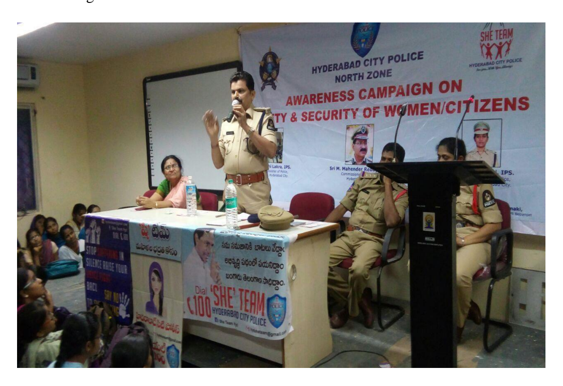
SHE Team Programme in the College

The majority of rapes occur in the victim's home. According to the Bureau of Justice, almost 40 percent of all rapes take place in the female victim's home. In the event that rape prevention fails—such as by avoiding problem areas or making sure a woman is never alone—the best chance for survival is to fight back. Fighting back is not just necessary, but it is a moral right because protecting one's self is paramount. The rest of the article will discuss why self-defense is important, some tools and techniques for effective self-defense, and information on gun use.