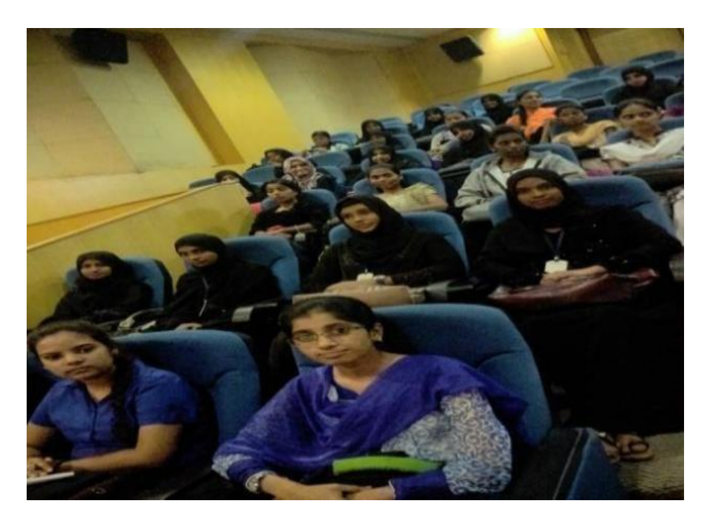
Students Participating in the programme