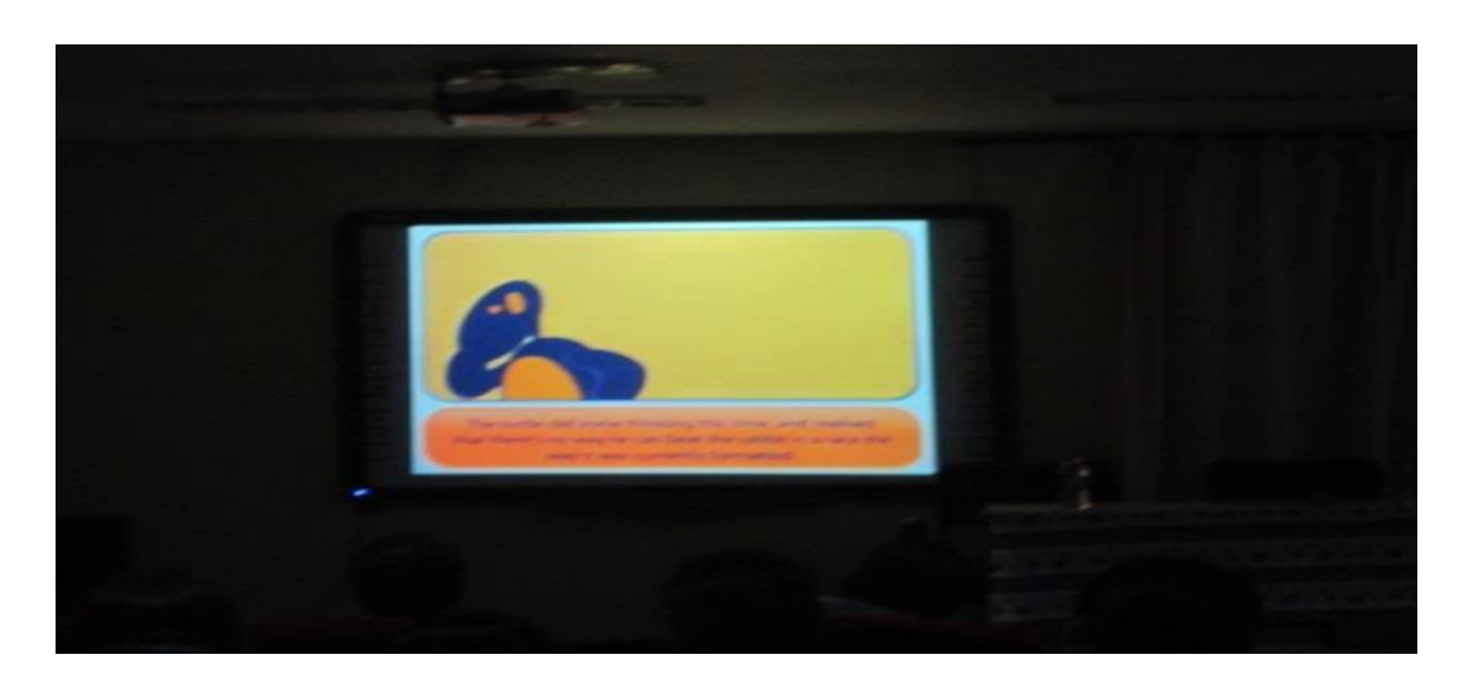
Videos on Team Work

The programme "Effective mentoring" how well you know your students? was organized to sensitize teachers to the needs of the students and also to adopt a professional and humane approach towards solving the problems of the student community. There is a need to focus on achieving a total well being of the student's physical, mental as well as social.