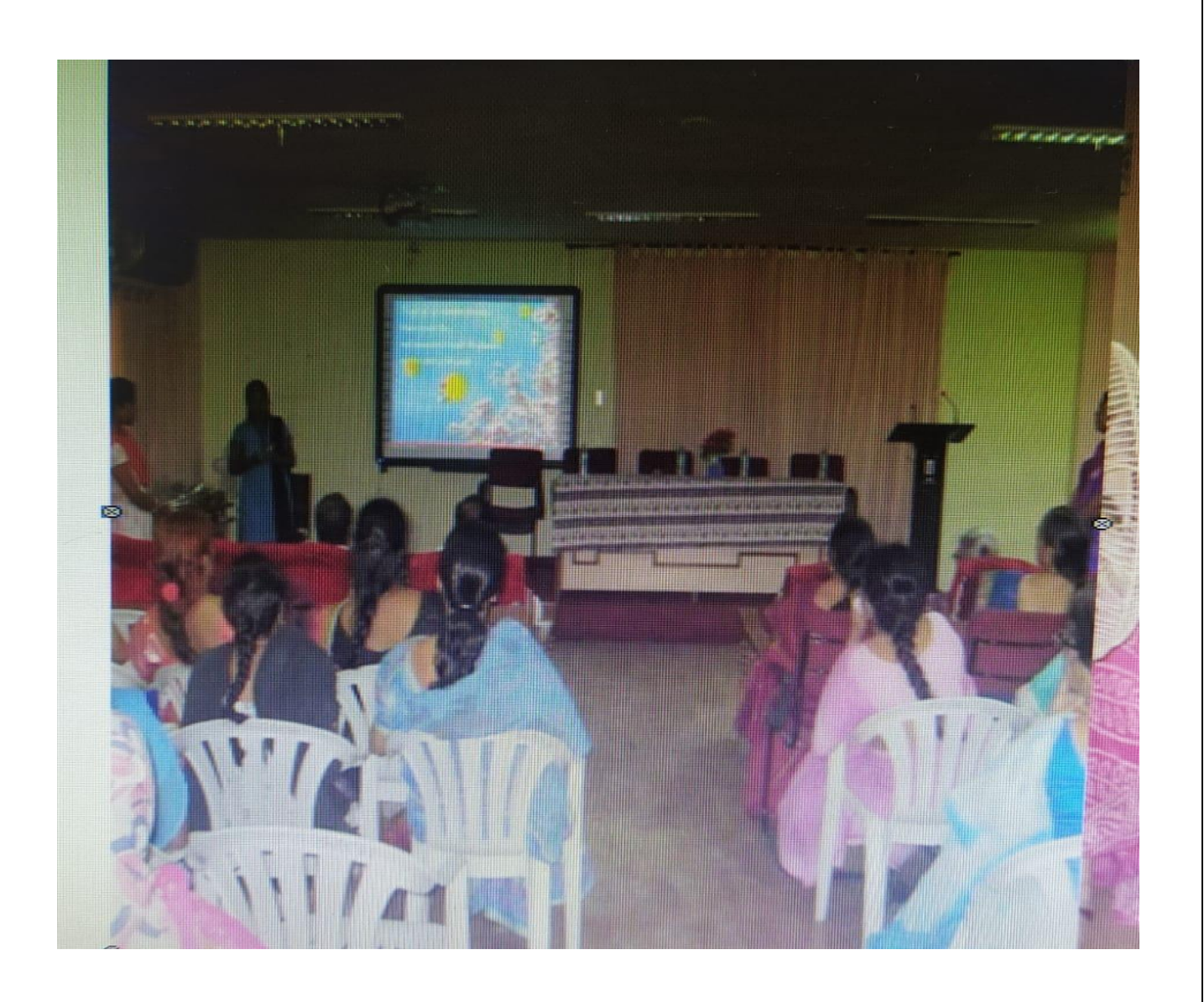
Videos on Team Work

Team work is mainly about situational leadership letting the person with the relevant core competency for a situation take leadership.