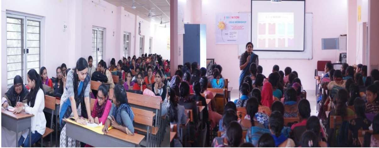
Creation of Ideas Workshop