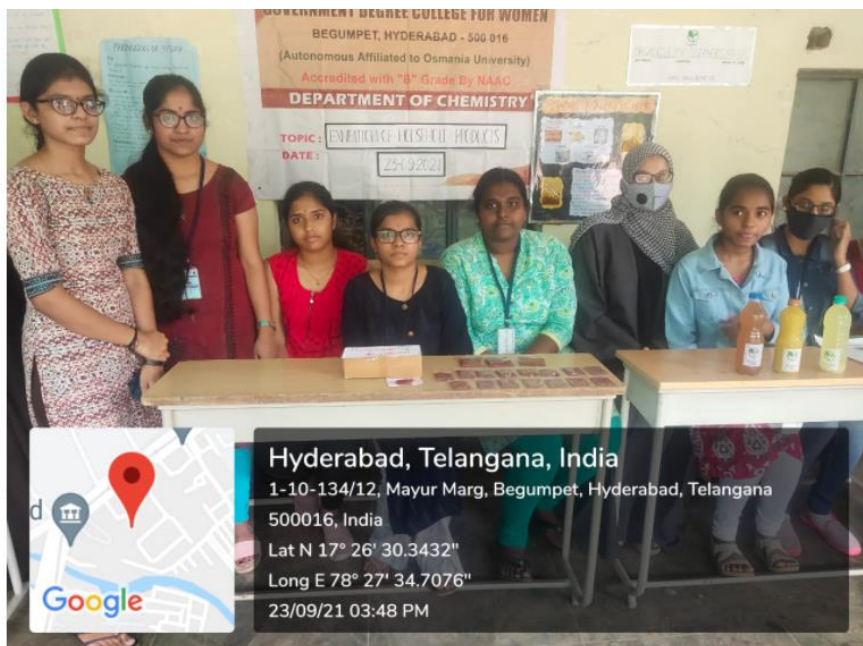
KumKummade by final year MbC students