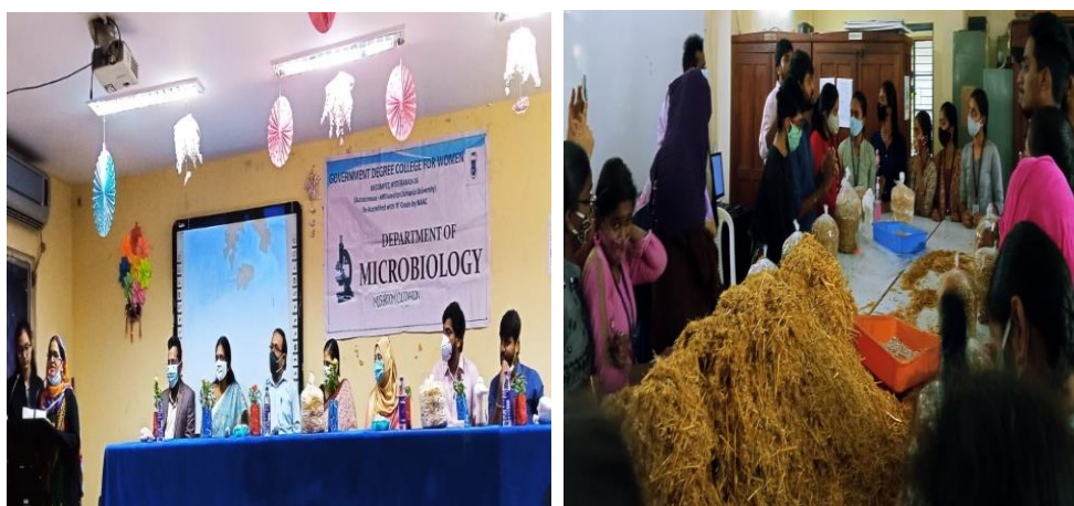
Students participating in Mushroom cultivation