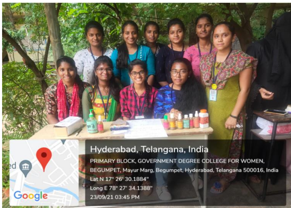
Hand Sanitizer and room freshner made by MPC and MPCS final year students