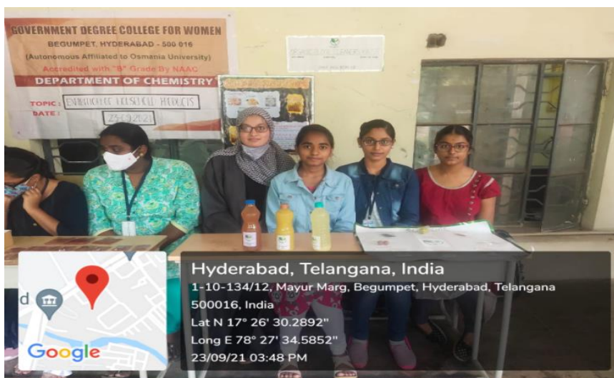
Flour cleaner made by final year MZC students