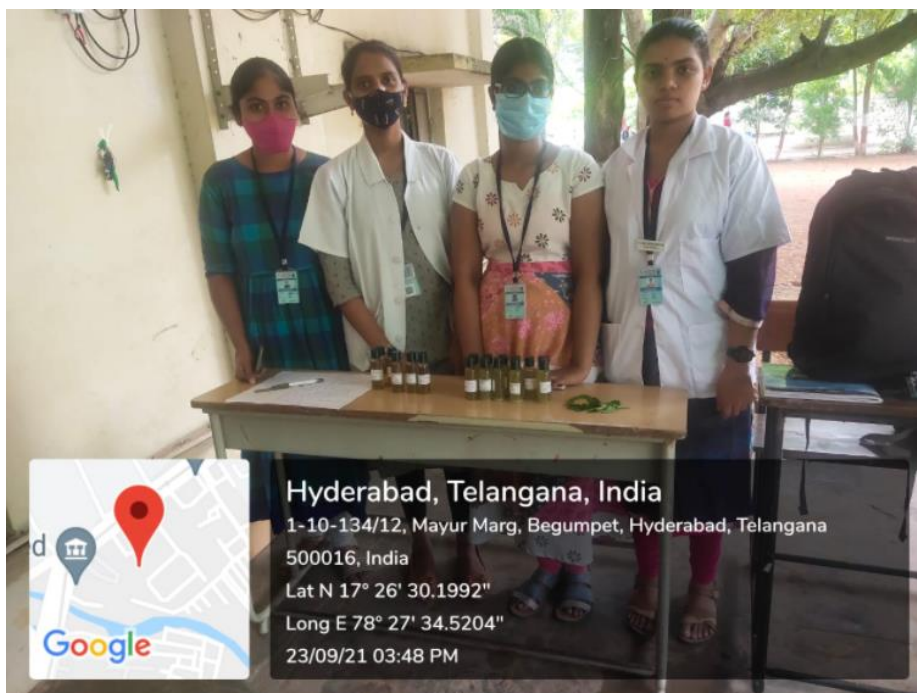
Herbal Oil made by final year MBC students