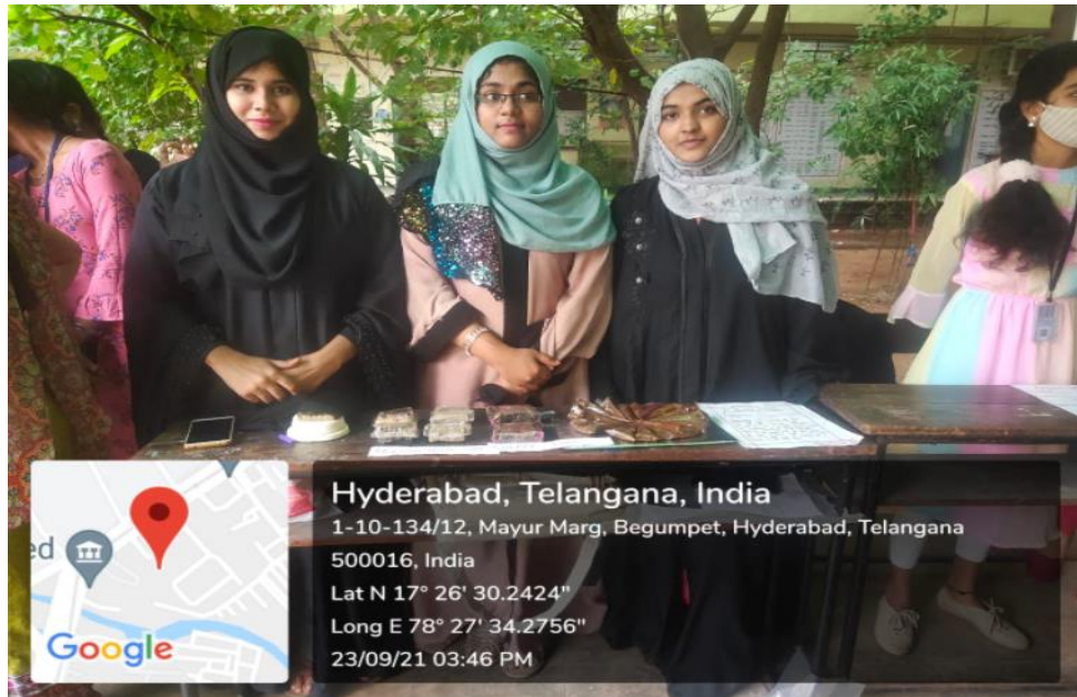
Mehendi and multanimitti soap made by AnBC and MBC final year students