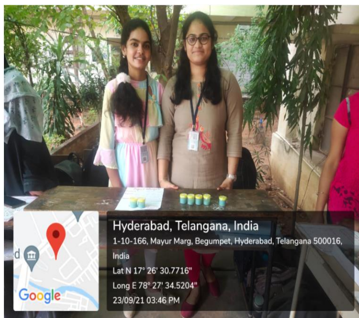
Detergents made by final BZC students