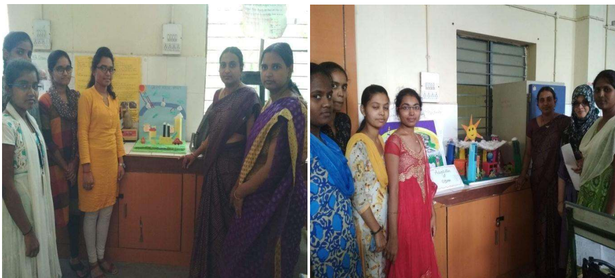
Model presentations on OZONE day by III YEAR B.Sc MPC students