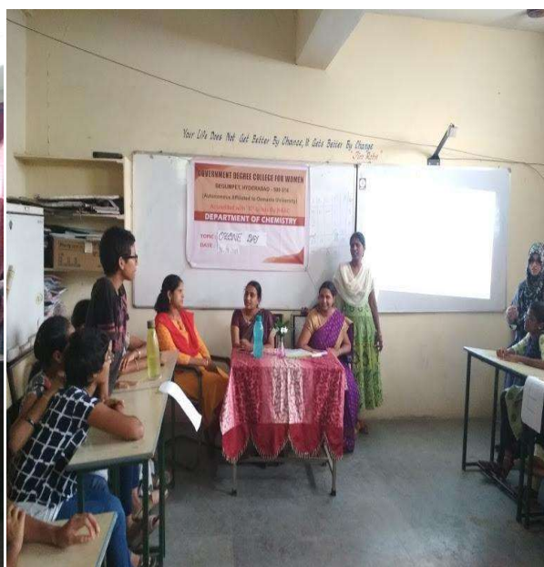
Quiz competitions on Ozone day(All III and II year students have participated in Quiz)