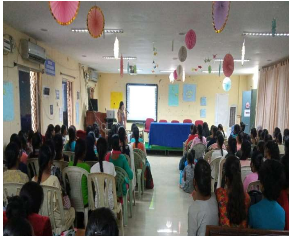
PRIMARY BLOCK, GOVERNMENT DEGREE COLLEGE FOR WOMEN, Mayur Marg, Begumpet, Hyderabad, Telangana 500016, India Hyderabad Telangana India 2022-05-13(Fri) 10:06