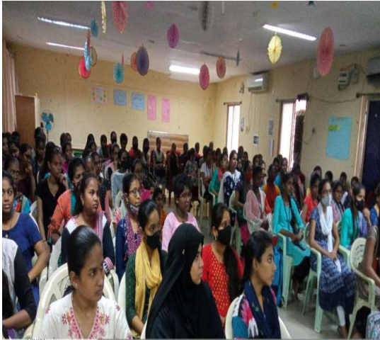
1-10-166, Mayur Marg, Begumpet, Hyderabad, Telangana 500016, India Hyderabad Telangana India 2022-05-13(Fri) 10:07