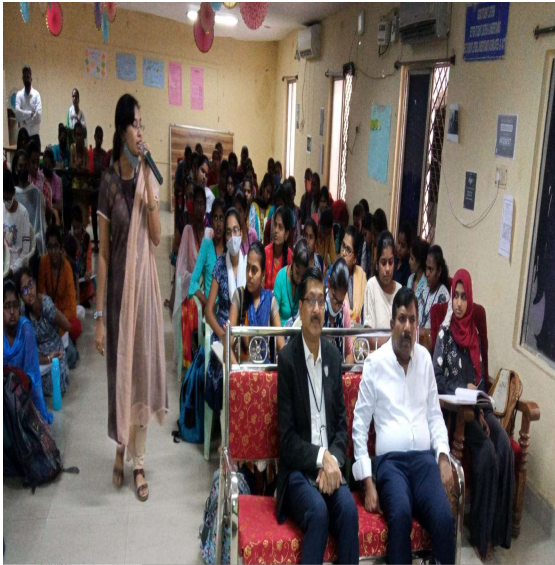
PRIMARY BLOCK, GOVERNMENT DEGREE COLLEGE FOR WOMEN, Mayur Marg, Begumpet, Hyderabad, Telangana 500016, India Hyderabad Telangana India 2022-05-13(Fri) 10:47