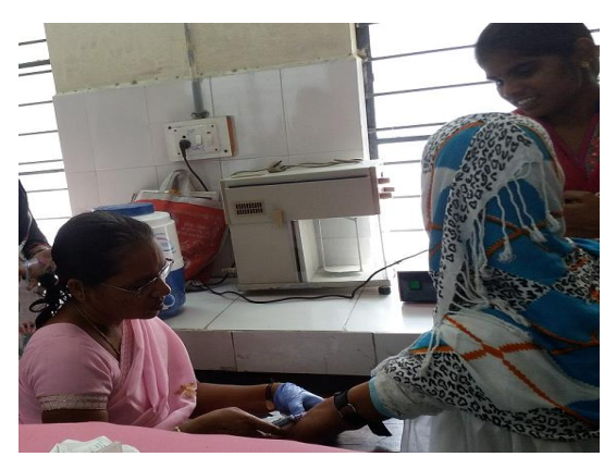
Blood sample collection