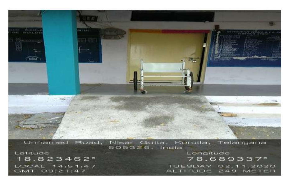
WHEELCHAIR FOR DIVYANJAN