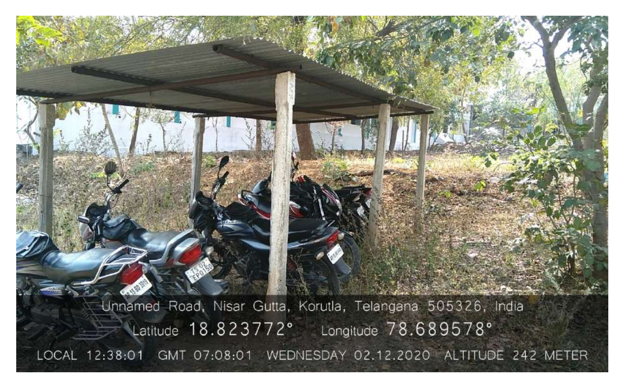
Bicycles and Bike Stand