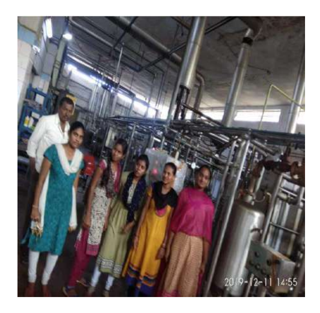
Students at Mother Dairy

The students have have meticulously observed the processing of milkk products and asked very pertinent questions like