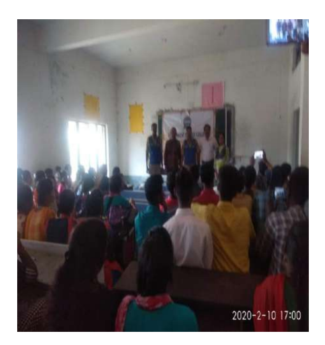
Police Personnel interacting with the students at WEC.

home. The Police Officers have explained about the mobile app developed by them that can come to the rescue of women during such situations.