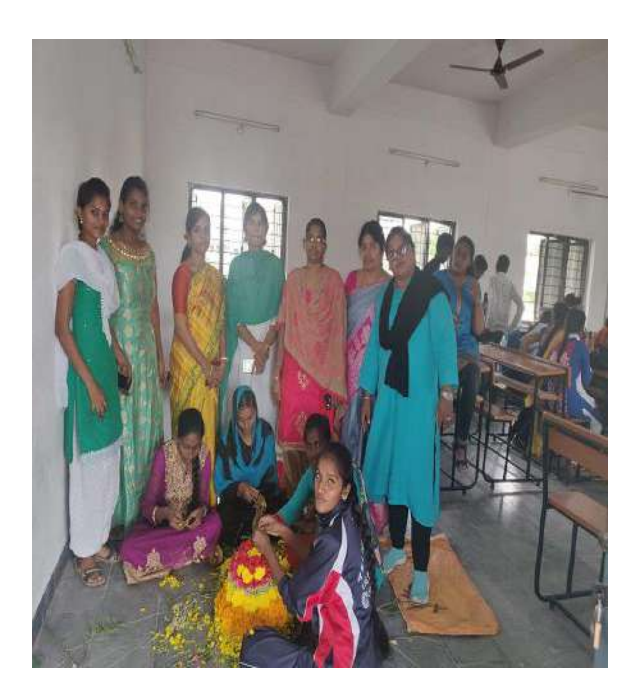
Staff and students making Bathukamma idols at college

The Government of Telangana has declared Bathukamma as the state festival that connects the routine life with nature. It is a festival of flowers that occasions the women make floral effigies with to great competitive spirit and adore the same as symbol good fortune. It's obvious that the Women Empowerment Cell took the lead of religiously celebrating the festival of Bathukamma as its fifth rose in its best practice of Ten Roses to highlight the culture of Telangana and how women are respected therein. Indeed, this festival is not without consummate event the а