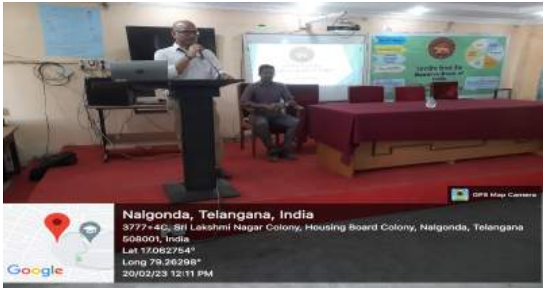
Official from RBI, explaining career in RBI