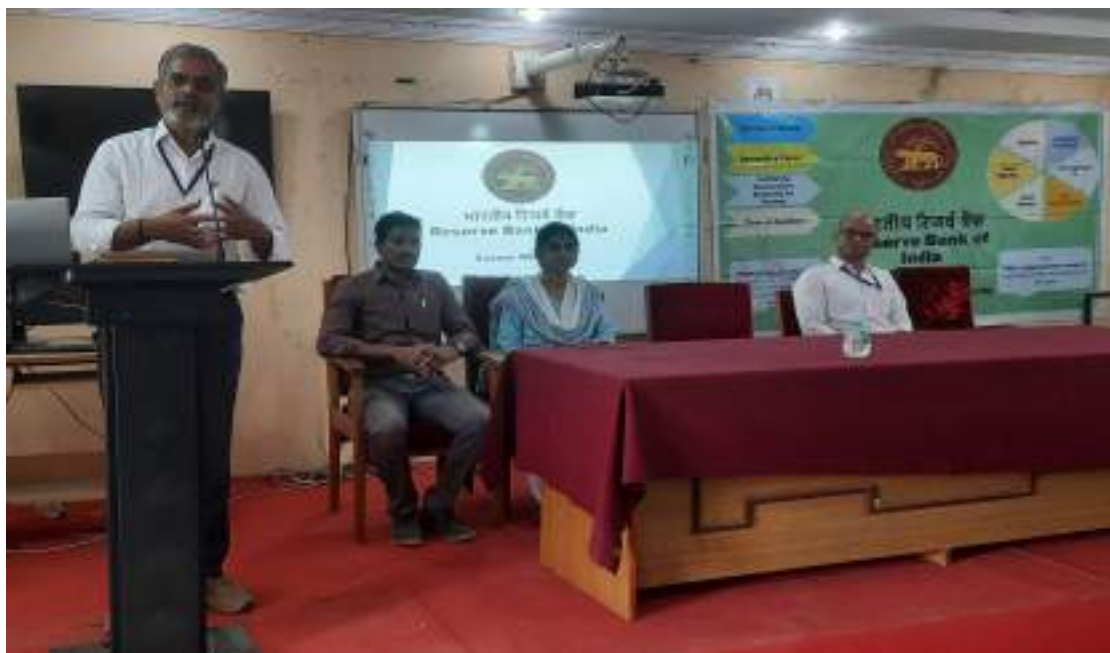
Principal Sir addressing to the students