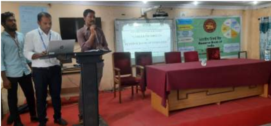
TSKC Coordinator inaugurating the session

TSKC conducted an Awareness Program on Career Prospects in Reserve Bank of India. In this program officials from Reserve Bank India, Hyderabad delivered a lecture on how to get a Job in RBI. Explain eligibility criteria, Syllabus. Conducted Mock test to students.