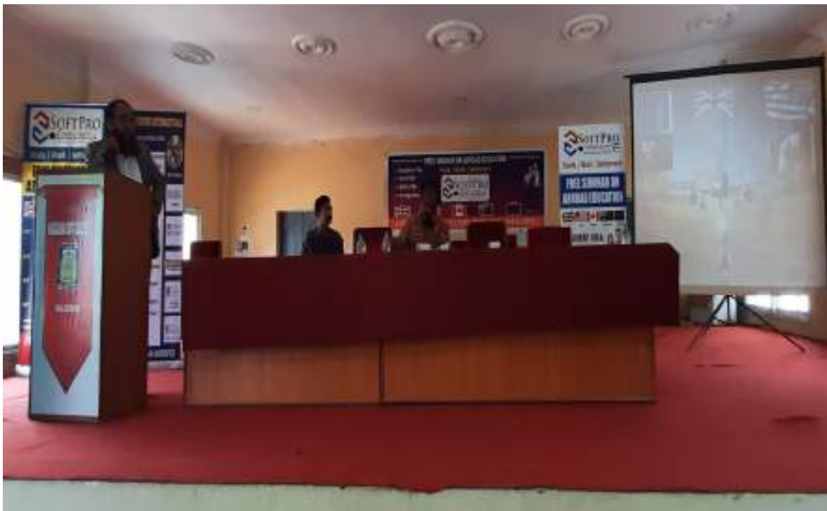
Recourse Person explaining the opportunities in Higher education in abroad