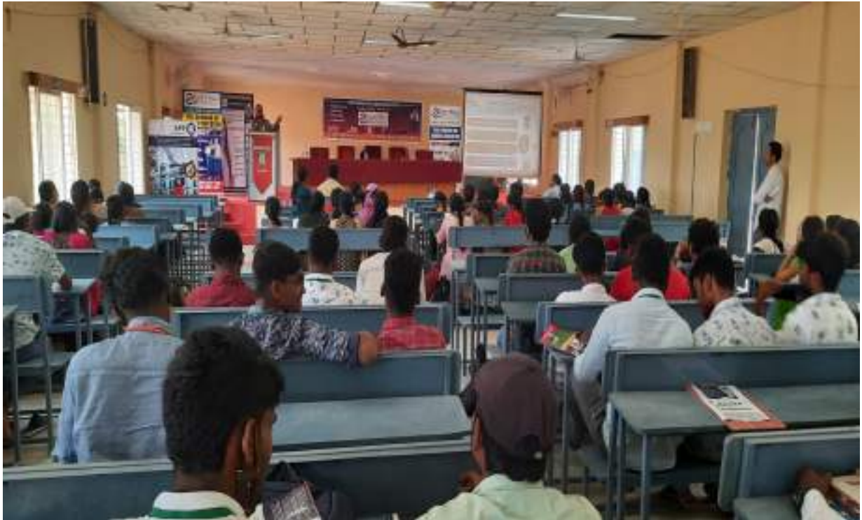
List of Student attended