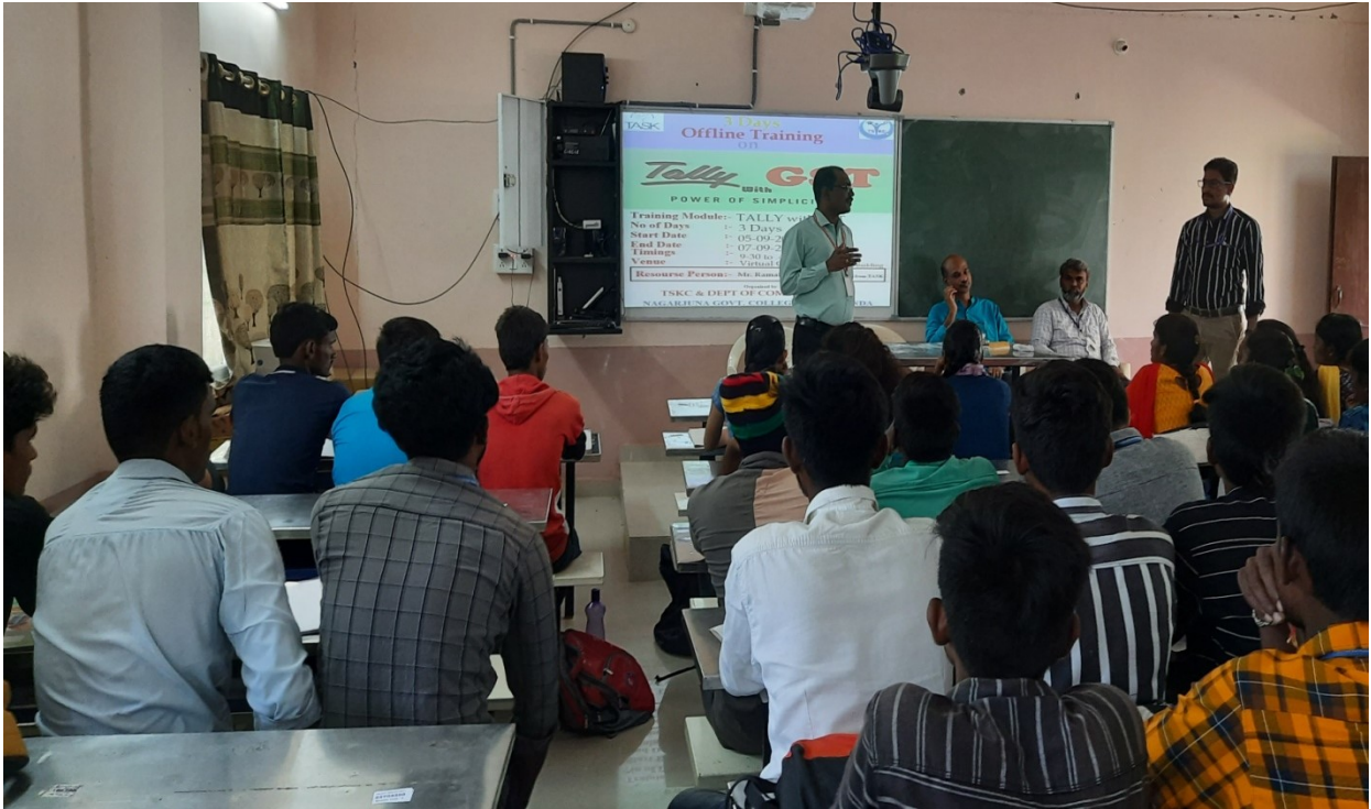
Commerce HOD explaining benefits of Tally