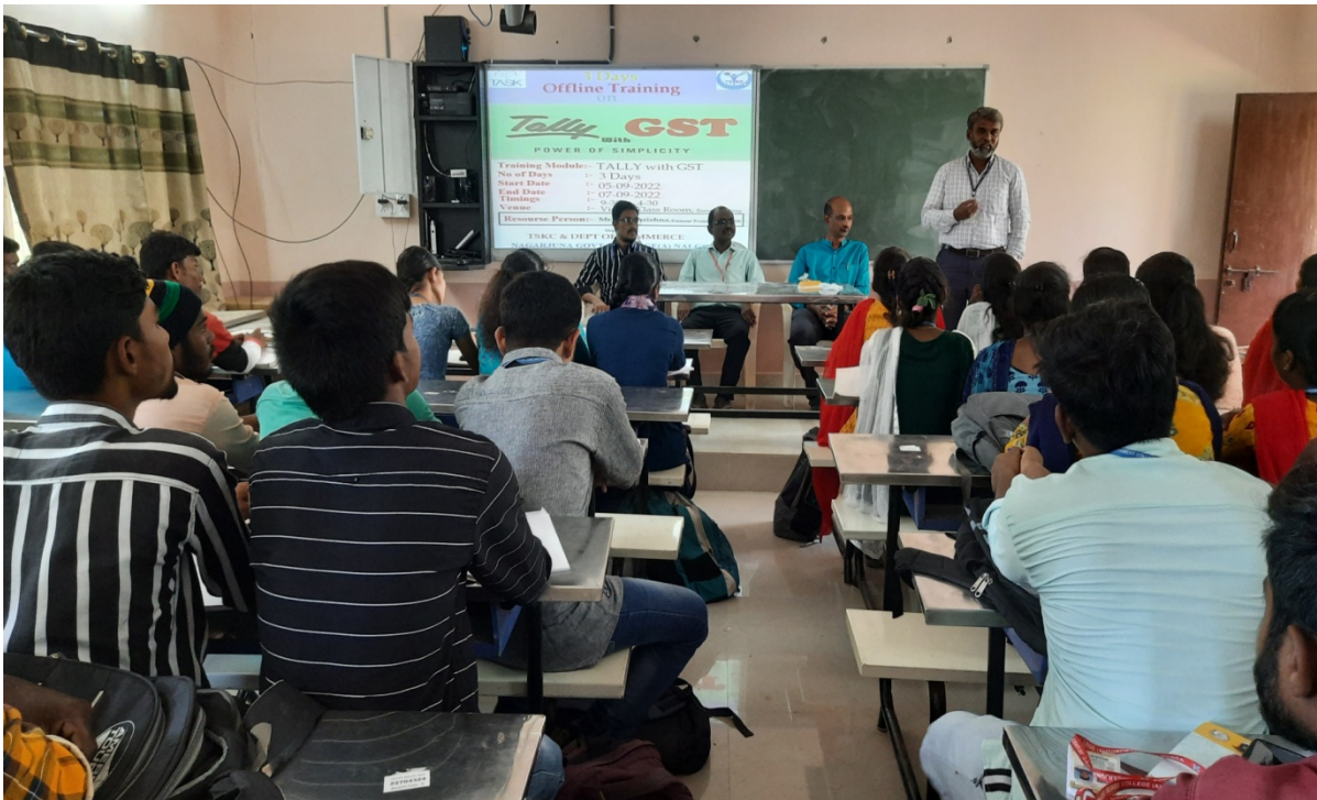
Trainer explaining course overview