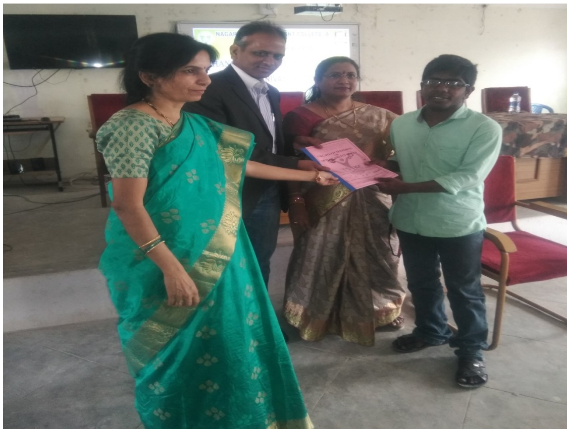
Distributing Handouts to students3