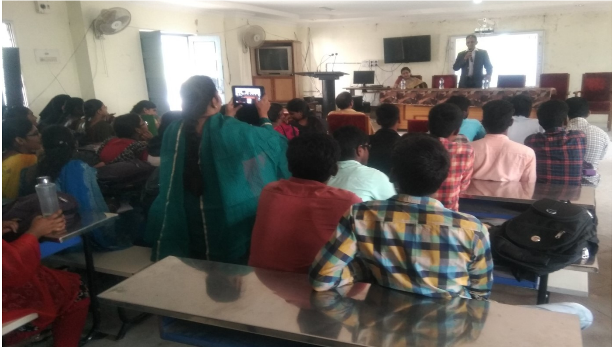
Resource Person Interacting with students