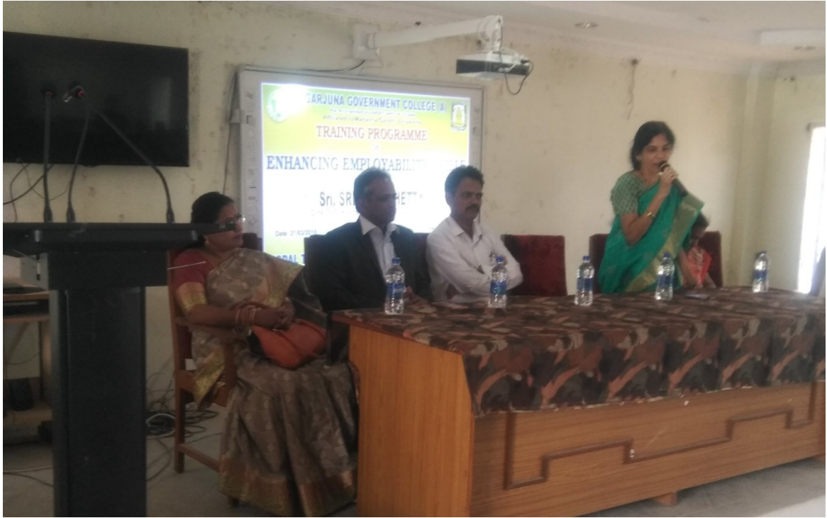
TSKC Coordinator inaugurating the session