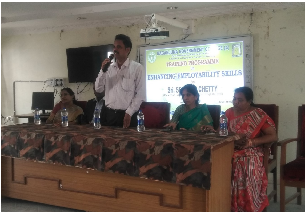
Vice Principal briefing importance of Employability Skills