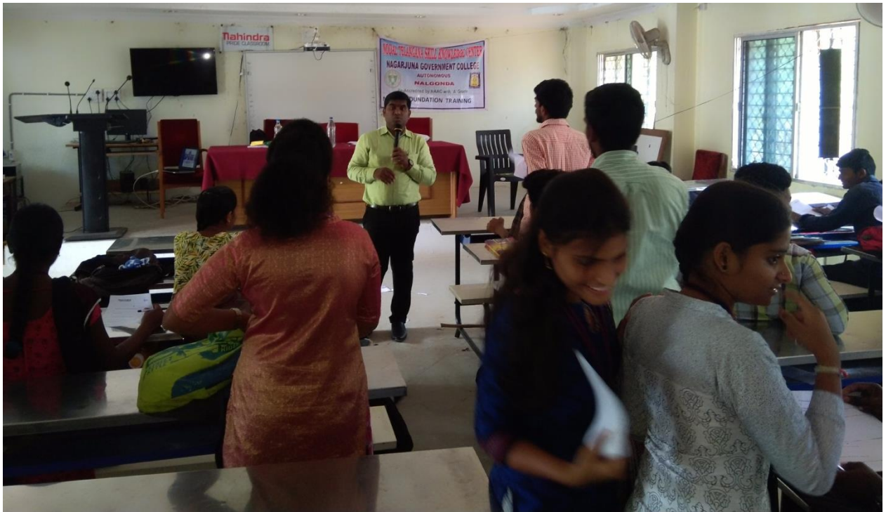
Resource Person conducting group activity