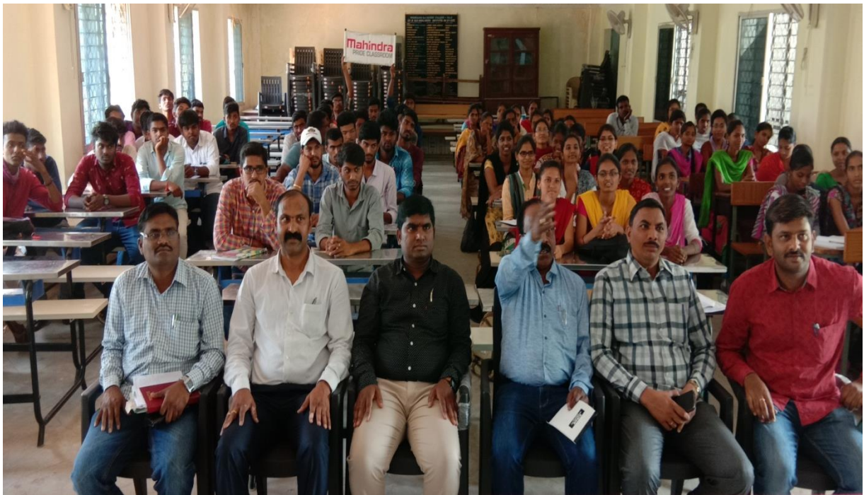
Group Photo with Participants