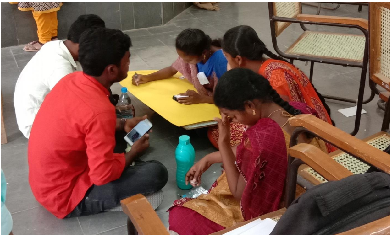
Poster Presentation Preparation